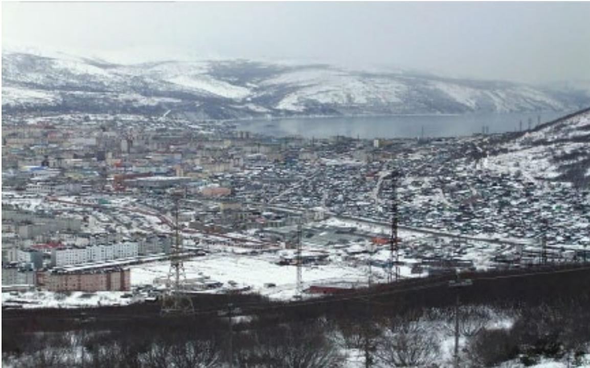
Magadan and Nagaev Bay, Sep. 2011