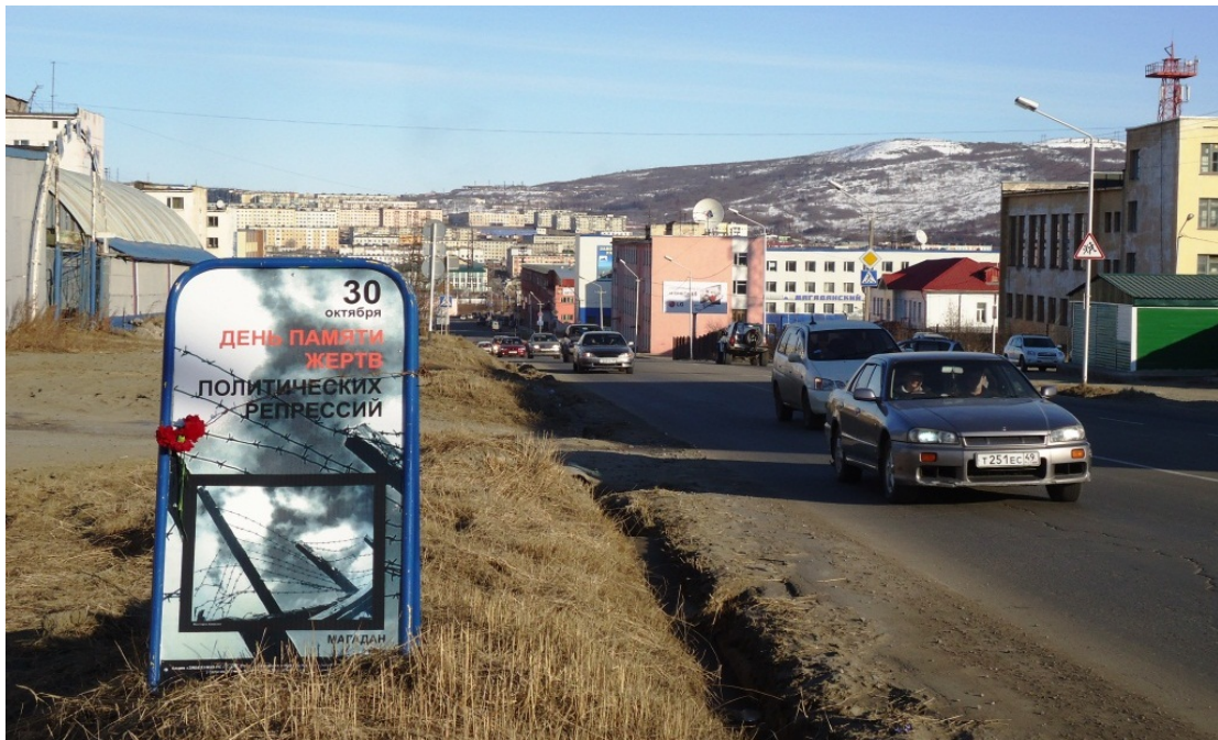
Marking the Road of Memory through Magadan on 30 October 2011