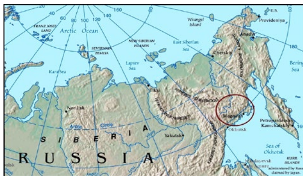
The Russian Northeast, map section from U.S.S.R. - Terrain and Transportation, 1974.

During the years of the Gulag Magadan functioned as the doorway to one of the most isolated and most dreaded punishment regions of the Soviet Union, according to Alexandr Solzhenitsyn, 'the greatest and most famous island in the Gulag Archipelago' (2003: xv). The Gulag functioned as a bureaucratic acronym for a special police department, created in 1929, that oversaw the administration of all corrective labour camps and labour settlements in the former Soviet Union ( Glavnoe Upravlenie Lagerei ). At the same time, the term 'Gulag' has also become synonymous with the entire system of excessive punishment and mass terror under the rule of Joseph Sta-