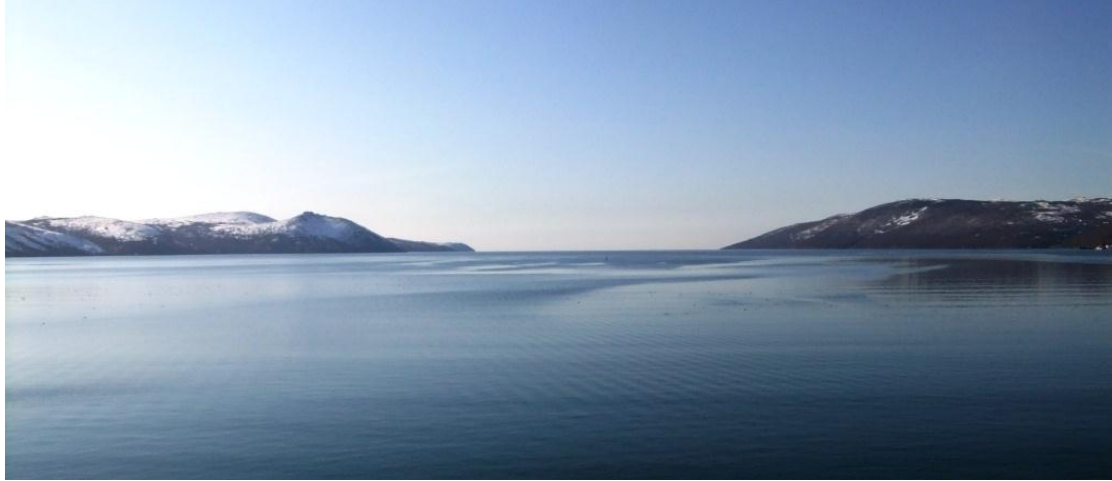
Nagaev Bay in Magadan