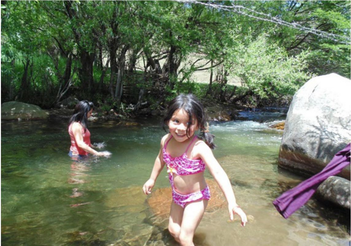
Figure 4: On hot summer days, children enjoy swimming in the river