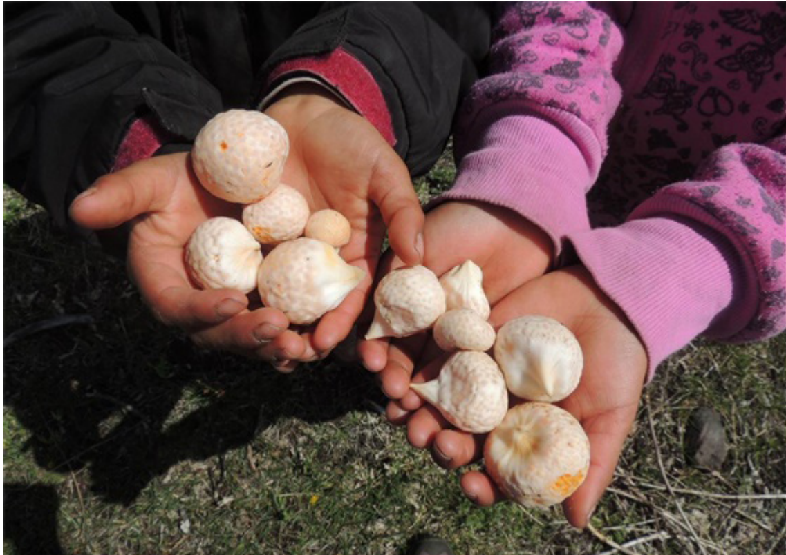
Figure 2: One of the children's favourite activities is foraging for mushrooms