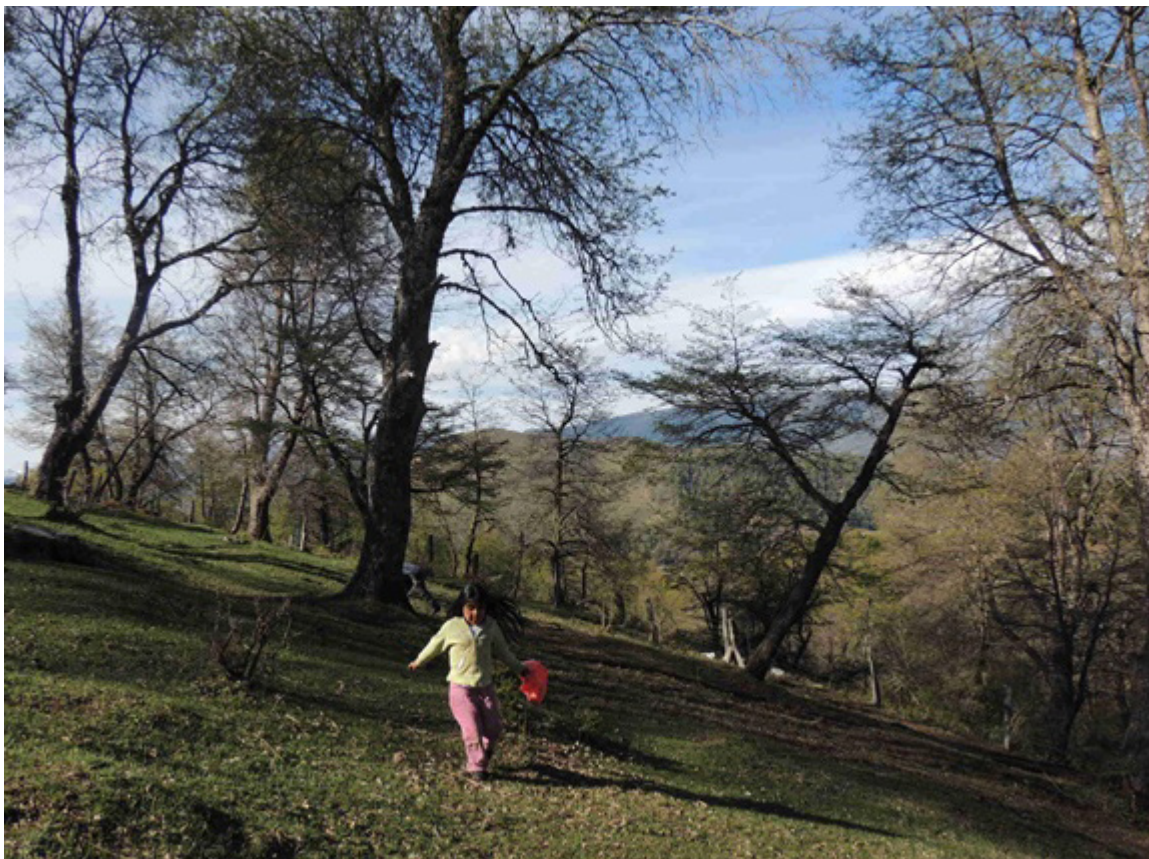
Figure 5: Children play in the forest