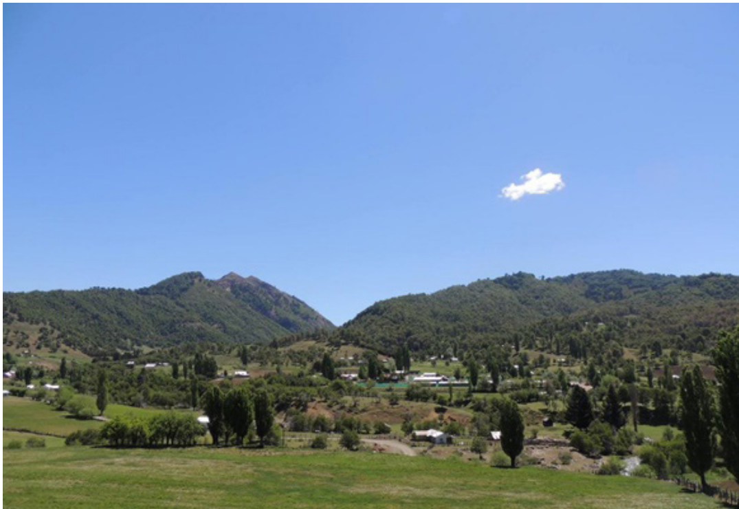
Figure 1: The field site is a Pehuenche community located between rivers, mountains and araucaria forests