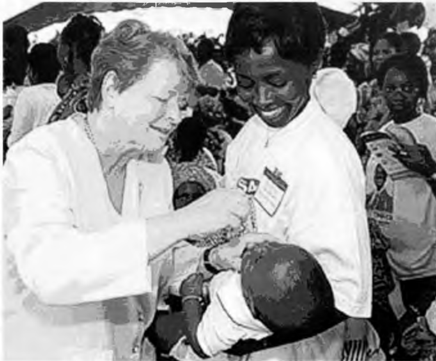
Figure 3: Dr Bruntland – current Director-General 12

revitalising the WHO, but what has happened to HFA2000? In Dr Bruntland's 16 page opening address in July 1998 she referred to HFA only once in reference to "keeping our long term objective of HFA..." 13 . She seems more interested in highlighting the importance of the special programmes especially relating to HIV/AIDS, which are more inclined to by-pass governments and be a "global initiative". WHO has to re-establish its two main roles; firstly to encourage governments and NGOs to work towards health for all, and secondly, to stress the need for partnerships between health and other sectors 3 .