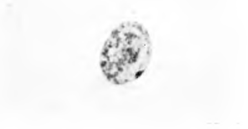
Fig. 3. Cell from the buccal mucosa of a normal female showing a single sex chromatin body (Barr body).

group 21-22 results in the profound disturbance of virtually every system in the body characteristic of mongolism. On the other hand the presence in an individual of an additional Y chromosome, which is of a comparable size, may be associated with no phenotypic abnormalities at all.