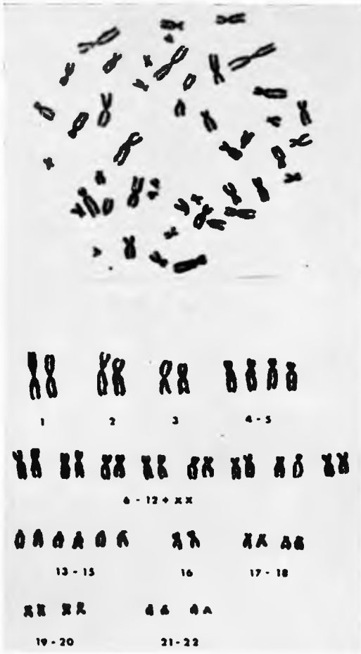
Fig. 2. Cell and Karyotype from a culture of the peripheral blood lymphocytes of a normal female.