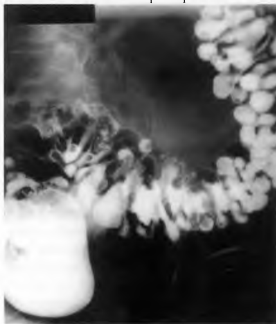
Figure 2. Barium enema showing severe diverticular disease

Crohn's Disease is a major cause of intestinal fistulae. It causes granulomatous transmural inflammation followed by axillo-inflammatory bifemoral graft. Approximately 25% of patients develop fistulae at some point, the anus being a common area. Crohn's presents with chronic diarrhoea, abdominal pain, weight loss and a spectrum of extra-abdominal symptoms. Fistulae are external or internal. External can be enterocutaneous or perianal. Internal fistulae are enteroenteric, enterocolic, enterovaginal and enterovesical. Confirmation of fistulae can be demonstrated with contrast studies. Abscesses must be drained and enterocutaneous fistula can result from Crohn's disease through the same mechanism. Treatment depends on the level of the fistula. Those with low output (<1 litre/day) will heal by secondary intention. Those with high output must be surgically repaired with excision of the affected bowel loop. Steps must be taken