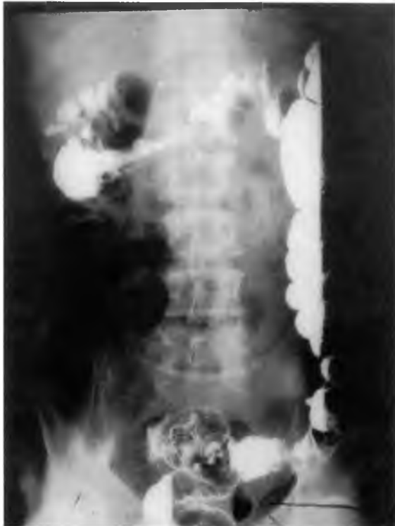
Figure 4. Barium enema showing air in urinary bladder

open the fistula. The track is then laid open and left to heal by secondary intention. This has no effect on faecal continence as the external sphincter remains intact. In higher fistulae, the track can only be opened to the ano-rectal ring. A ligature is thus passed through the upper track and left for 2 to 3 weeks for scar tissue to form.