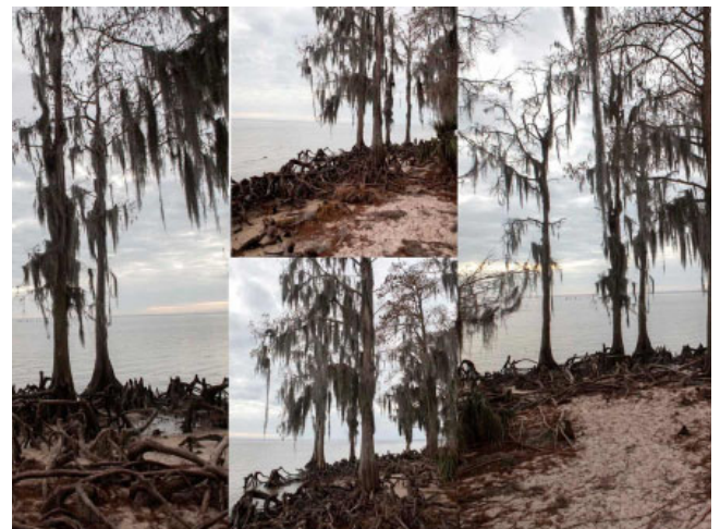
Image: Cypress Trees.