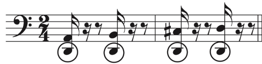
Figure 5: The pattern of ostinato in lower voice