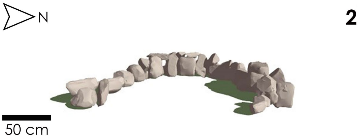
Figure 1. Parapetos in central-western Santa Cruz province, Patagonia, Argentina. 1. Example of a parapeto in the Strobel Plateau. 2. Sketch of a parapeto .

Figura 1. Parapetos en el centro-oeste de la provincia de Santa Cruz, Argentina. 1. Ejemplo de parapeto en la meseta del Strobel. 2. Esquema de parapeto.