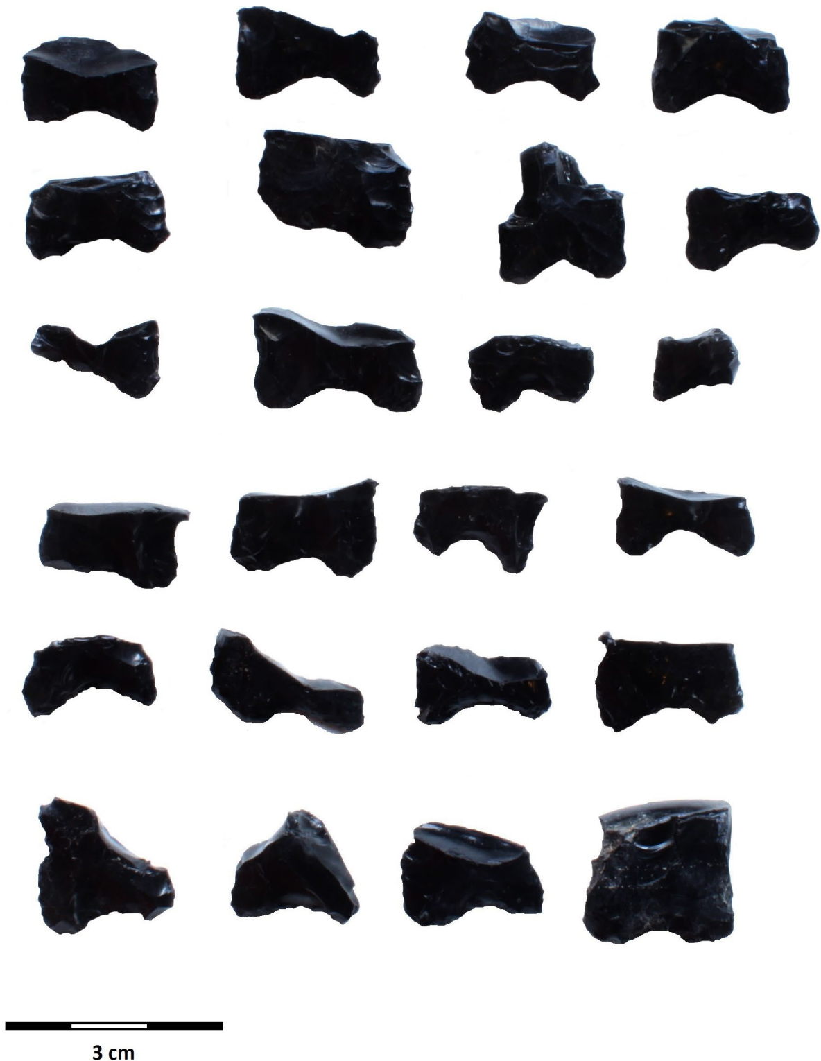
Figure 3. Projectile points stems in stone structures from the Strobel Plateau.

Figura 3. Pedúnculos de puntas de proyectil en estructuras de piedra de la meseta del Strobel.