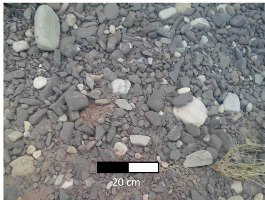
Figure 5. View of dry runway of Ampascachi river and detail of available rocks. The scale bar is 20 cm wide (in two 10 cm segments).