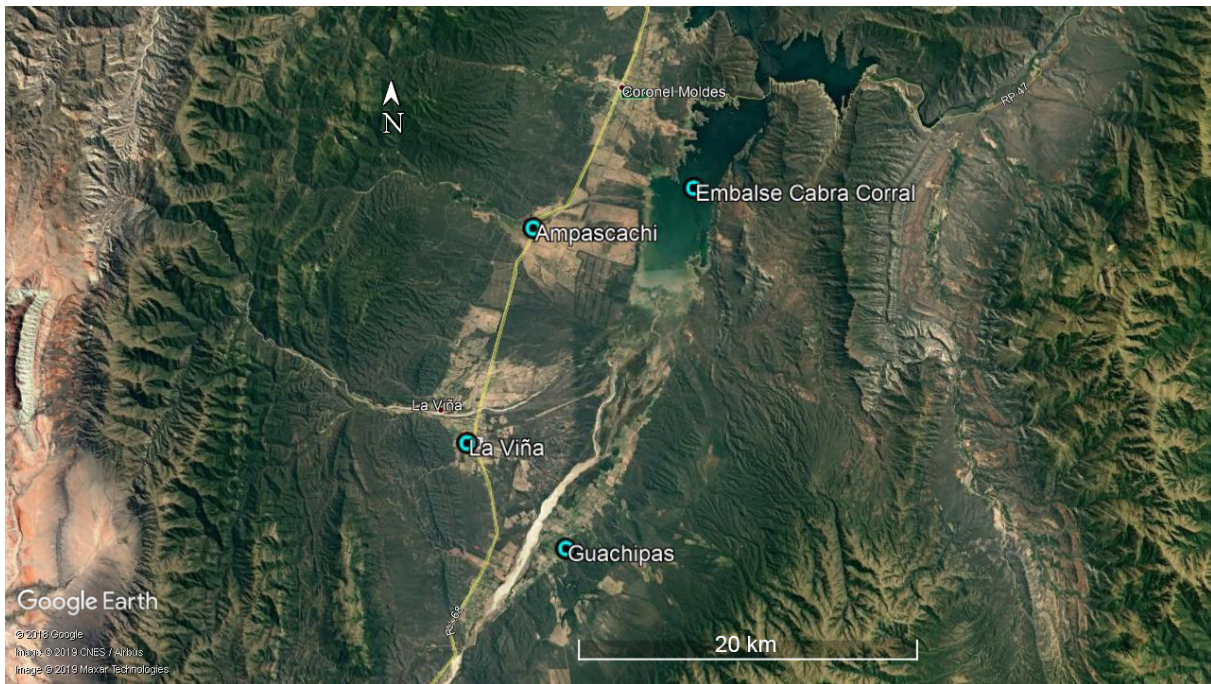
Figure 2. Map with towns from which the samples were collected. (See the KMZ supplementary file for details.)

Archaeological sites under study are located specifically in La Viña department and border with Guachipas town. Even though this town lacks a meteorological station and information is from Talapampa and Ampascachi (south and north respectively) it may be asserted that the weather corresponds to tropical serrano with dry season. Even though precipitation average is about 450-500 mm a year, in the summer these can be torrential, focusing between November and March, being intense and short with very variable precipitation values in time span (Moya Ruiz 1989). Prevailing winds come from E and NNE (Alonso et al. 2000; Gelli 1990, among others). Between April and September weather is cold to mild and warm to mild weather the rest of the year, and the average temperature per year is 19.2°C, with a maximum of 41.8°C and a minimum of -4.5°C (Moya Ruiz 1989).