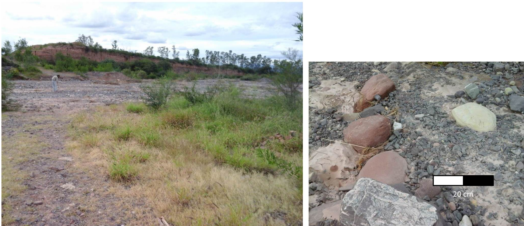
Figure 4. View of La Viña river and detail of available rocks. The scale bar is 20 cm wide (in two 10 cm segments).