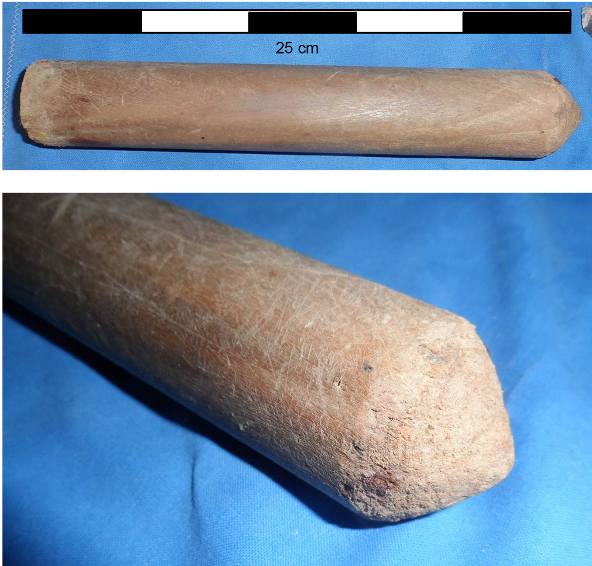
Figure 6. Quina billet after being used. Notice the wearing. The scale bar is 25 cm long (in 5 cm segments).