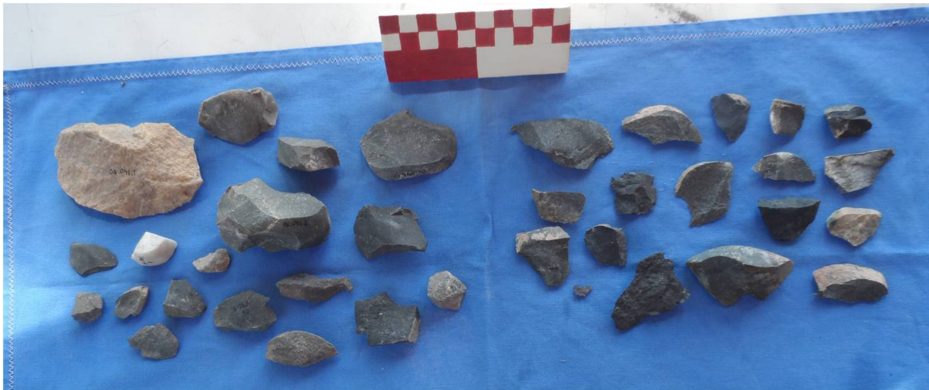
Figure 7. To the left archaeological material, to the right experimental products. Notice similarities regarding objective pieces and distal end of flakes. The scale bar is 10 cm wide (in ten 1 cm segments).