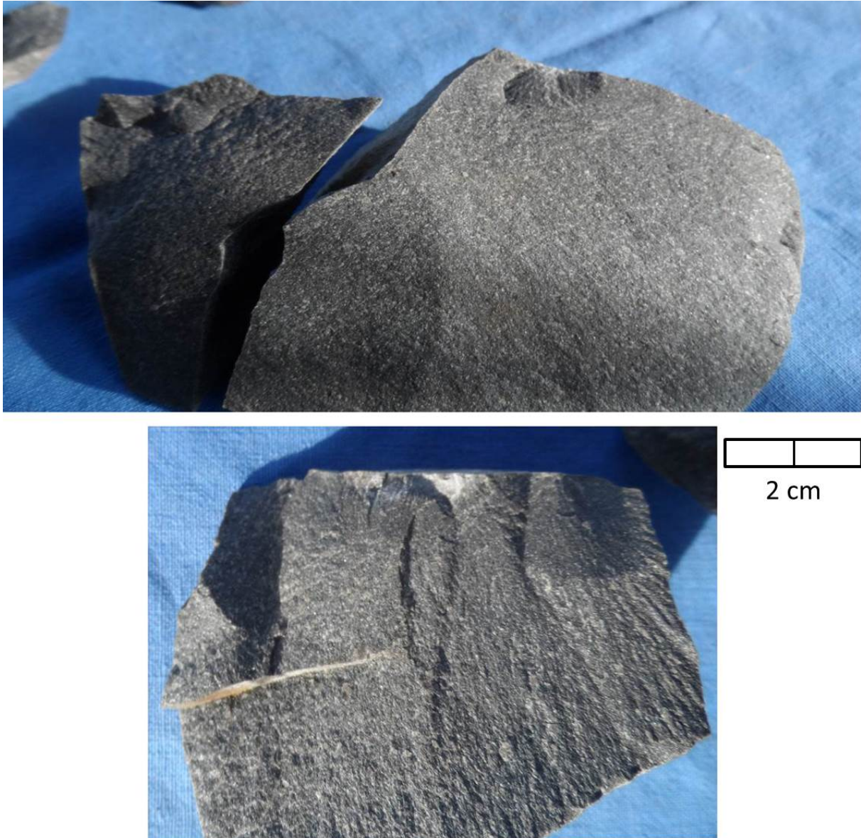
Figure 8. Double and triple bulbs in experimental material. The scale bar is 2 cm wide (in two 1 cm segments).