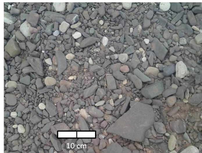
Figure 3. View of Guachipas river and rock availability. The scale bar is 10 cm wide (in two 5 cm segments).