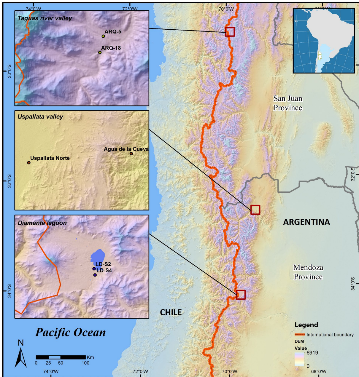
Figure 1. Study area and archaeological sites.

(Cabrera 1971). Mountain wetlands or vegas are very important because they offer rich summer pastures, especially for guanacos ( Lama guanicoe ), which are the largest mammals and most important prey in the Andes. In the northern and central part of the study area, lithic raw materials are principally chert and rhyolite; in the southern area, there is good availability of obsidian (Castro et al. 2014; Durán et al. 2012; Cortegoso et al. 2017; Cortegoso 2008; Lucero et al. 2006).