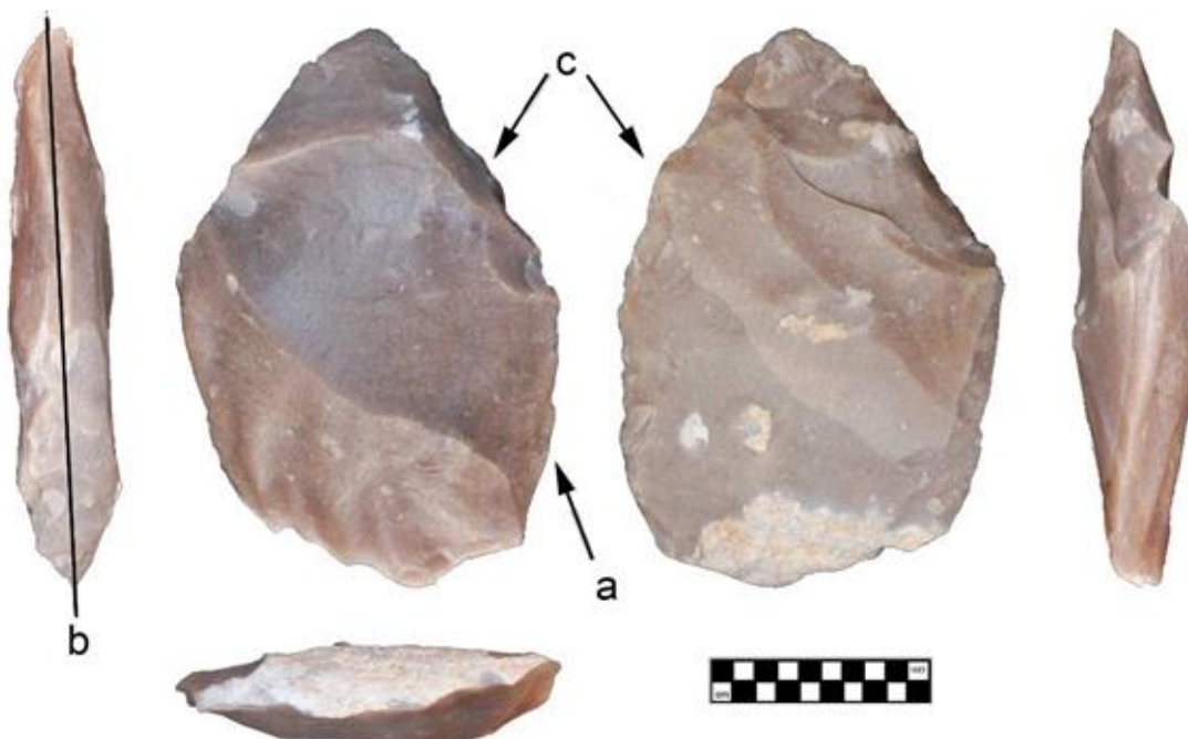
Figure 7. Replica 2 biface after removal of second overshoot flake. a) overshoot termination; b) resulting biface plane; c) platform prepared for the removal of Flake 3 from the other face.

An isolated, slightly projected platform was prepared by faceting, reduction and heavy grinding (Figure 6a). This was located on the margin opposite that from which Flake 1 was struck. Alternating margins is a trait seen on many Clovis bifaces (for example, see Waters & Jennings 2015: 122-123). It was also spaced so that it would only slightly overlap with the previous scar (Figure 6b). In order to encourage the formation of an overshoot, the opposite margin was unifacially, abruptly flaked (Figure 6c) so as to bring the edge above the intended biface plane. This assists with the extension of the fracture to the opposite margin (Figure 7a),