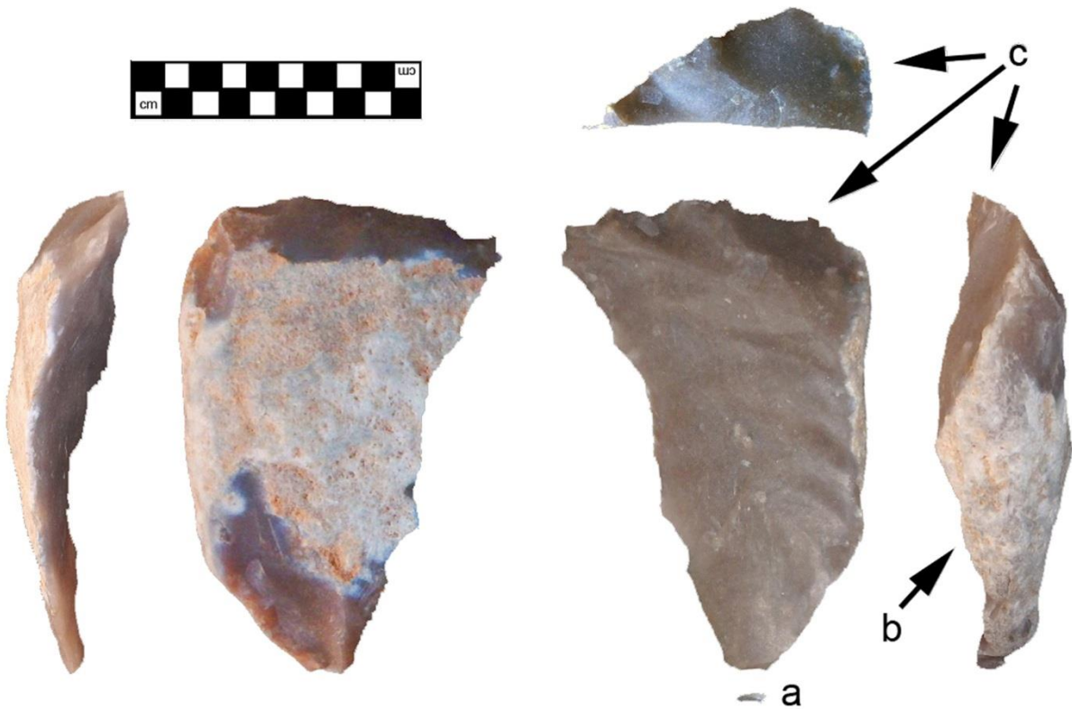
Figure 4. Replica 2 Flake 1 overshoot flake. A) platform; b) large basal removal; c) removed margin.

This flake was intended to remove a large portion of the base of the blank, thinning it without losing length. This was best accomplished by removing an overshoot flake, splitting the thick round base. I was not concerned with there being significant width reduction.