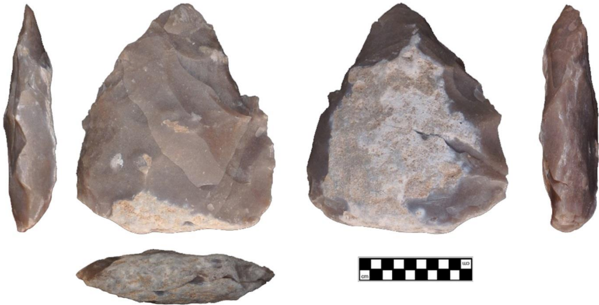
Figure 3. Replica 2 roughed-out biface blank