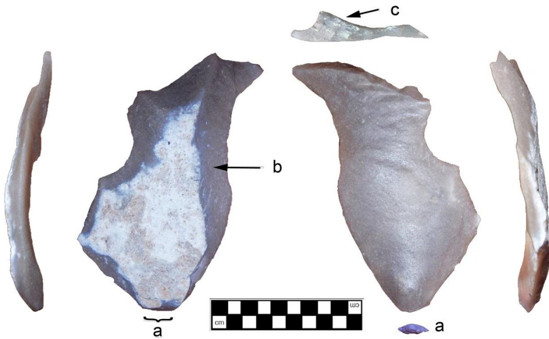
Figure 6. Replica 2 Flake 2 overshoot flake. a) prepared platform; b) spacing in relation to previous flake scar; c) margin removed by overshoot showing unifacial edge adjustment.