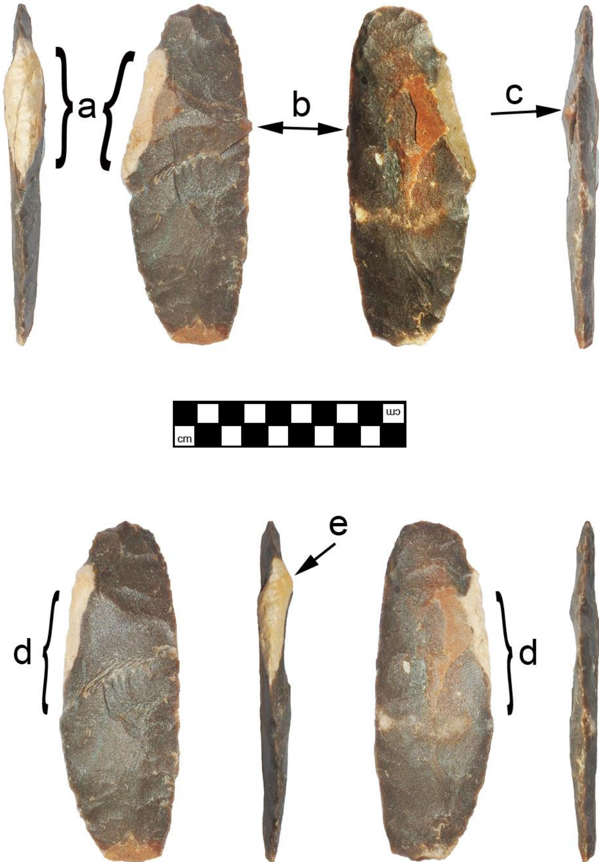
Figure 1. Replica Clovis middle phase biface with intentional successful overshoot flake removal. A) cortex 'mass' on biface margin; b) isolated platform; c) projected platform; d) area of margin removal; e) remaining cortex 'mass'.