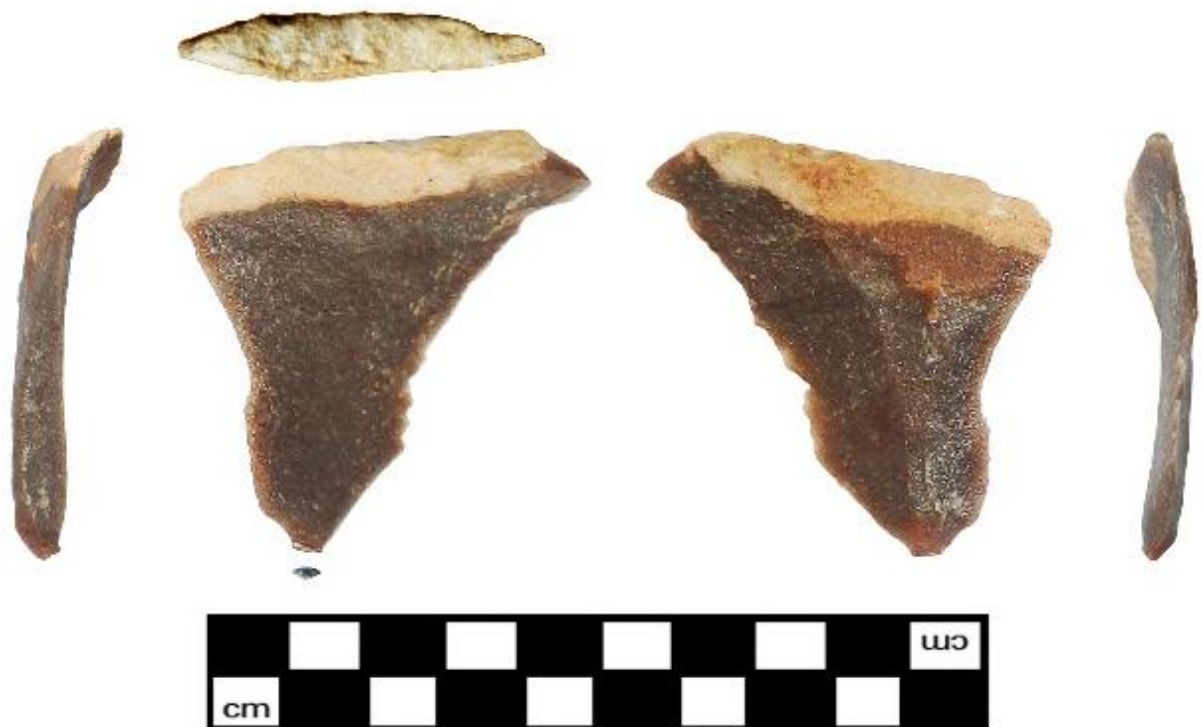
Figure 2. Replica 1 biface overshoot flake.