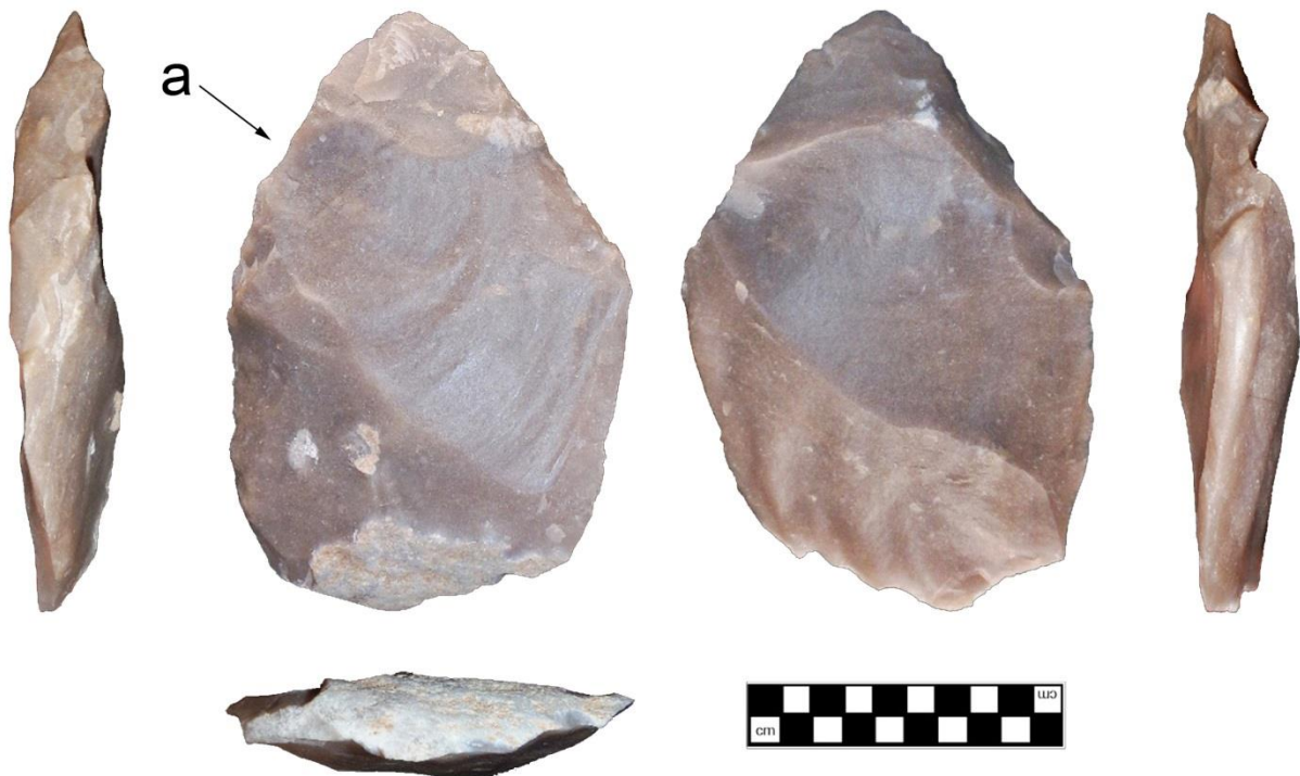
Figure 9. Replica 2 biface core after removal of full-face flake 3 (a).

This removal produced a regular relatively thin, straight flake (Figure 8) suitable for use as a butchering tool. With unifacial resharpening of one or both lateral margins it would conform to tools recovered from Clovis kill or butchering sites (for examples see Hester 1972: 103 [fig. 93f]; Boldurian & Cotter 1999: 66 [fig. 30]). The resulting core (Figure 9) is typologically and technologically representative of early to middle phase Clovis flake cores (for examples, see Bradley et al. 2010: 60 [fig. 3.4]) and retains the potential for the removal of additional large flake blanks and ultimately could be processed into a Clovis point.