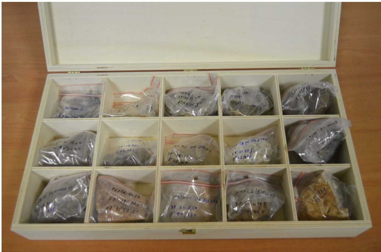
Figure 2. Custom-made poplar wood boxes with some of the hand geological samples from LusoLit.

In regards to the storage of the samples, the subdivision of larger nodules makes the individuals to fit into a maximum size of 7x8x5 cm that is the size of the slots in custom made poplar wood boxes (Figure 2). This subdivision creates samples for future analysis such as heat treatment and burning. The remaining volume is kept as reserve for future samplings such as thin sections. The poplar wood boxes are stored in steal shelves, while the larger blocks are stored in standard industrial plastic boxes. Each specimen has a specific slot in a specific wood box where a physical tag is added with part of the information related to the source. The specimen receives coordinates again in order to create redundancies and avoid mixing.