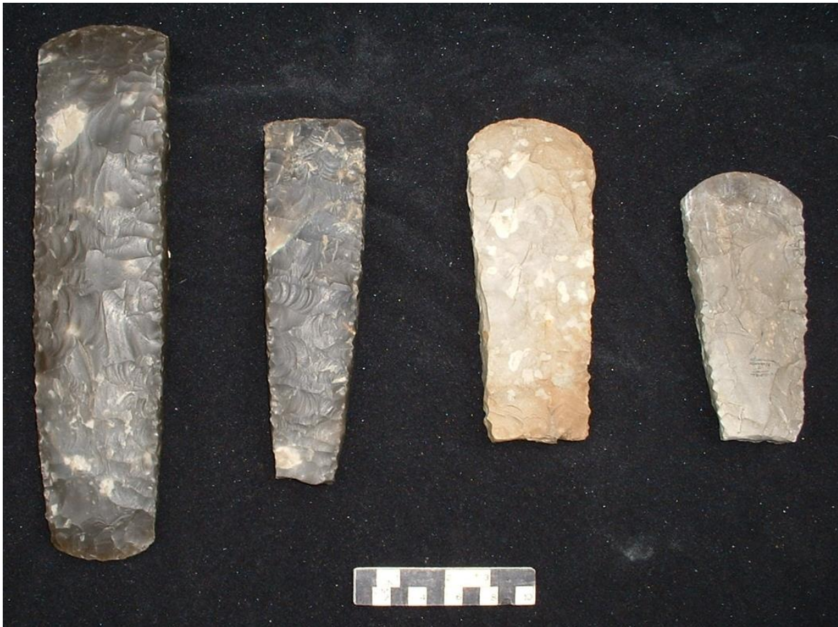
Figure 3. A sampling of Are's square-section axe work.