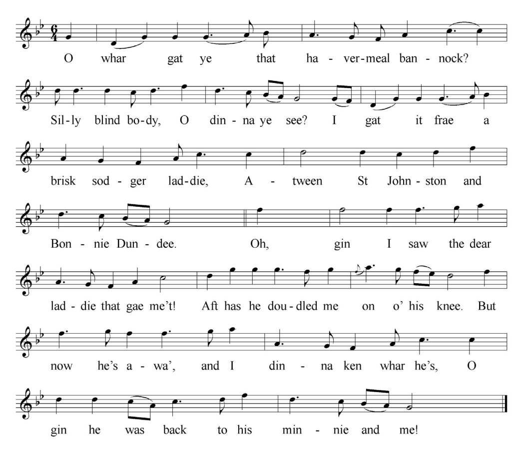
Figure 1: 'Bonie Dundee'.

of the baby, thus creating a contradiction with the traditional opening line which he retained. He had already made the change when he jotted down his opening stanza on a blank page in a letter from the Earl of Buchan dated 1 February 1787.<sup>41</sup> The stanza is untitled and runs: