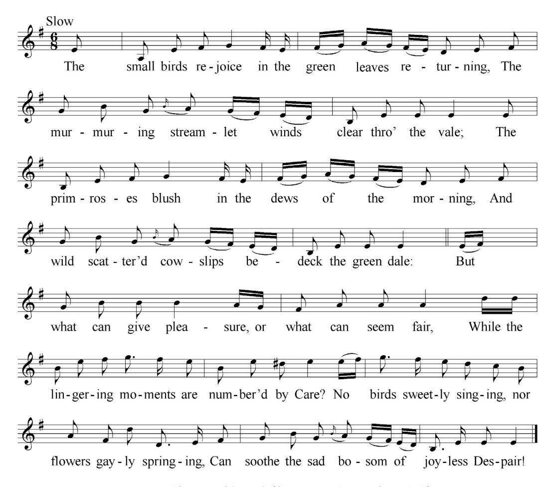
Figure 3: 'Captain O'Kane'.

Burns defers to Cleghorn in speaking of the music and Cleghorn in his reply of 27 April (Currie 1800: 2, 144) confirms the matching of words to tune, saying: