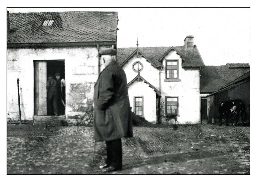
Figure 5: Thorn Farm Steading, Bearsden, East Dunbartonshire Libraries.

hope of a Christian. The summer was very fine in the months of July and August, despite much thunder and heavy rain, which did considerable damage to the turnips. On 24 August, we began cutting oats, and on September 4, we had done cutting. On September 11 we had all the oats in, and, on the 15<sup>th</sup>, all the beans in.