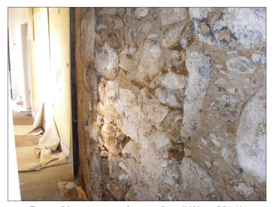
Figure 4: Mastrick, interior of east corridor wall (Alistair Mutch).