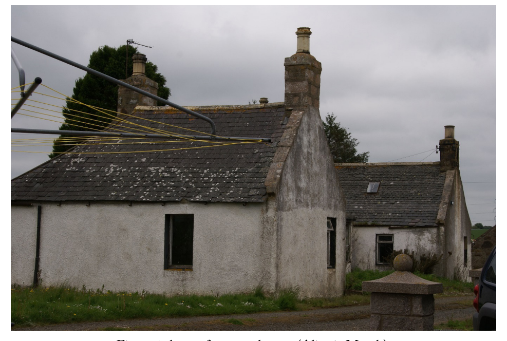
Figure 2: house from south west (Alistair Mutch).