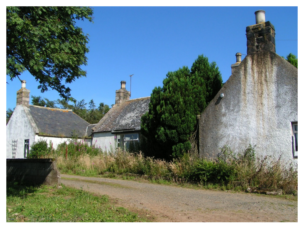
Figure 1: house from south east (Alistair Mutch).