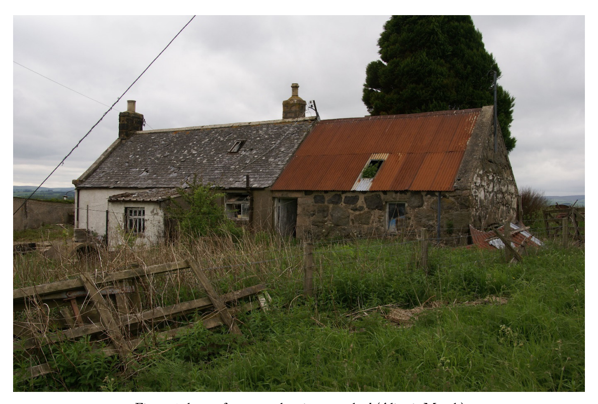
Figure 3: house from east showing rear shed (Alistair Mutch).