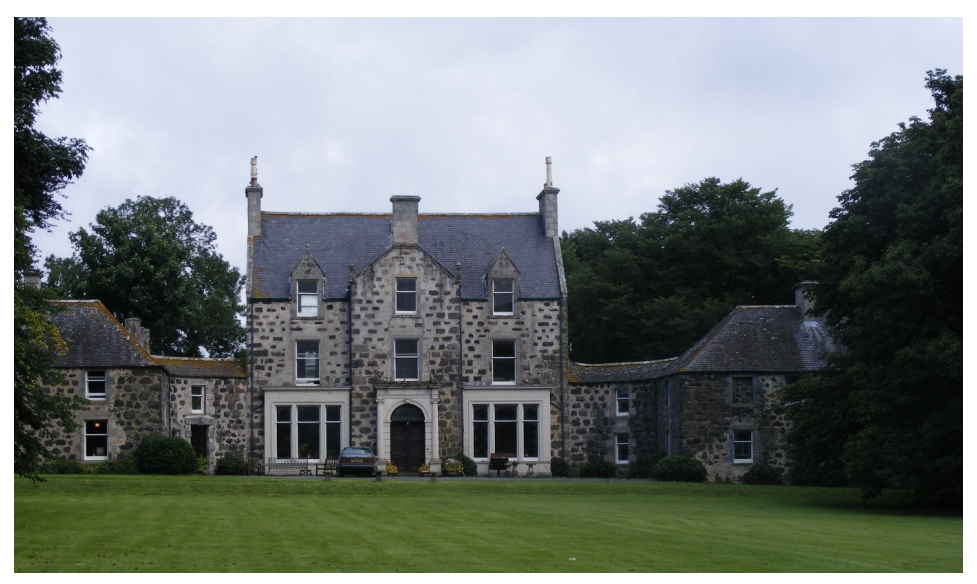
Figure 5: Freefield front elevation showing projecting wings (Alistair Mutch).