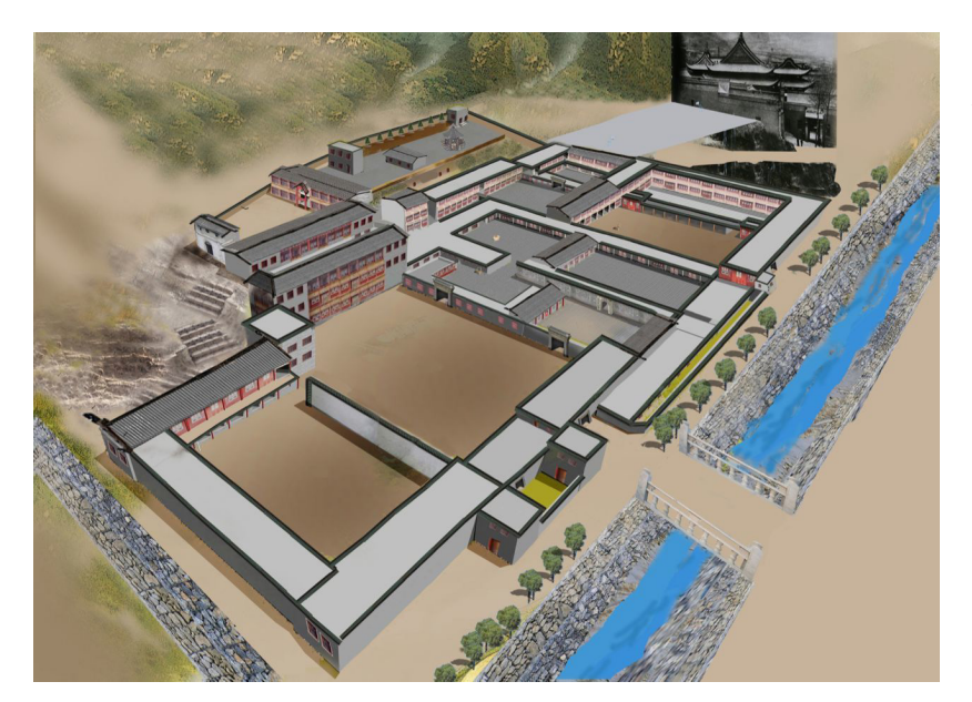
Figure 2: 3-D Plan of Xidaotang Compound in Taozhou Old City in the 1930s.

(Plan made and provided by Xidaotang management committee in Lanzhou)