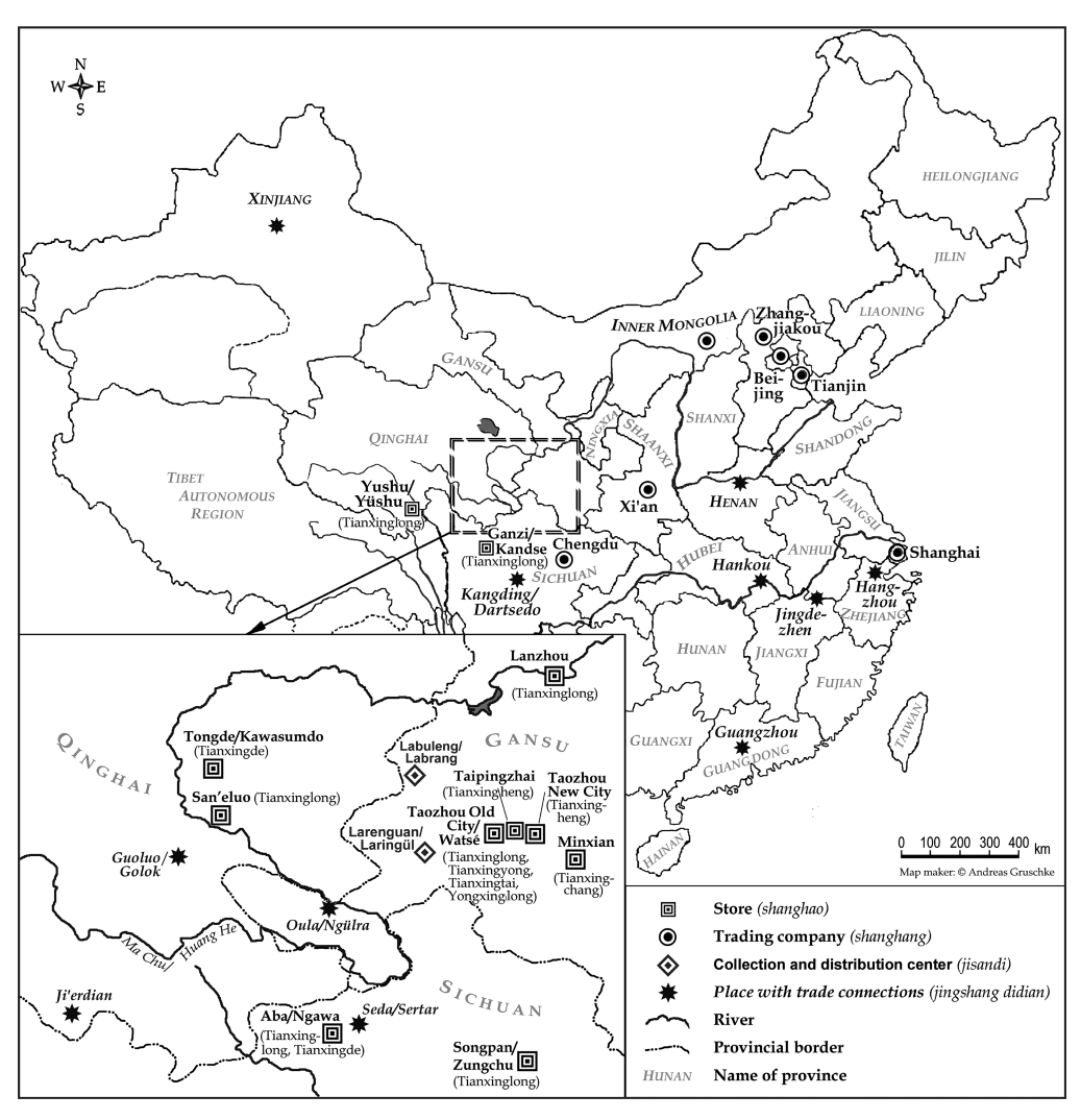
Figure 3: Xidaotang trade network in the 1930s.

(Plan made and provided by Xidaotang management committee in Lanzhou)