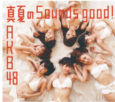
[Fig. 1.1. Cover of ‘AKB48’'s so far bestselling single ‘Manatsu no Sounds Good!’ (‘真夏のSounds good!’, ‘Midsummer Sounds good!’); AKB48 Official Website , akb48.co.jp/about/discography/detail_cd/?media_id=18 ]