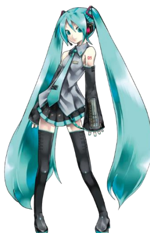
[Fig. 3.1. The figure of 'Hatsune Miku'; Crypton Future Media, Inc. , ec.crypton.co.jp/pages/prod/vocaloid/cv01_us ]