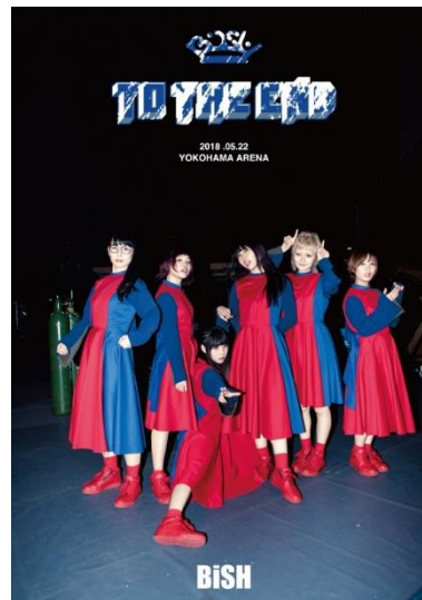
[Fig. 1.2. Cover of ‘BiSH’'s album ‘TO THE END’ ]