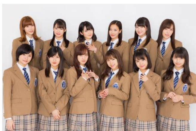
[Fig. 2.1. An official photo of 'Morning Musume'; Morningmusume Official Website , helloproject.com/morningmusume/profile/ ]