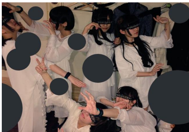
[Fig. 1.4. Japanese female idol group ‘. . . . .’ (‘Dots’); Dots Tokyo Official Website , dots.tokyo/about/ ]