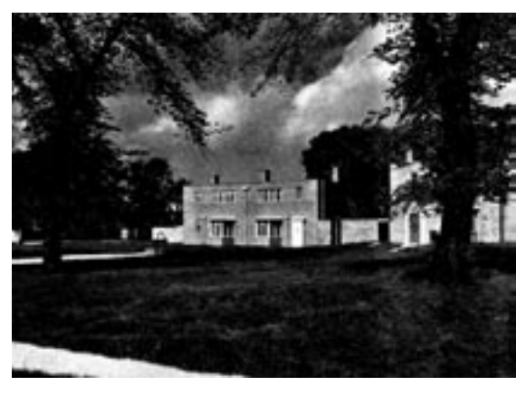
FIGURE 2: Instructive contrasts made by Brenda Colvin in order to show the potential for what she termed 'new beauty': above, an 'unplanned nineteenth-century development. Industry and dwelling-houses together, with no open spaces' and below 'A modern group of workers' houses' where the architect AW Kenyon 'has made full use of existing trees', photographs from Land and Landscape, figs 90-91.