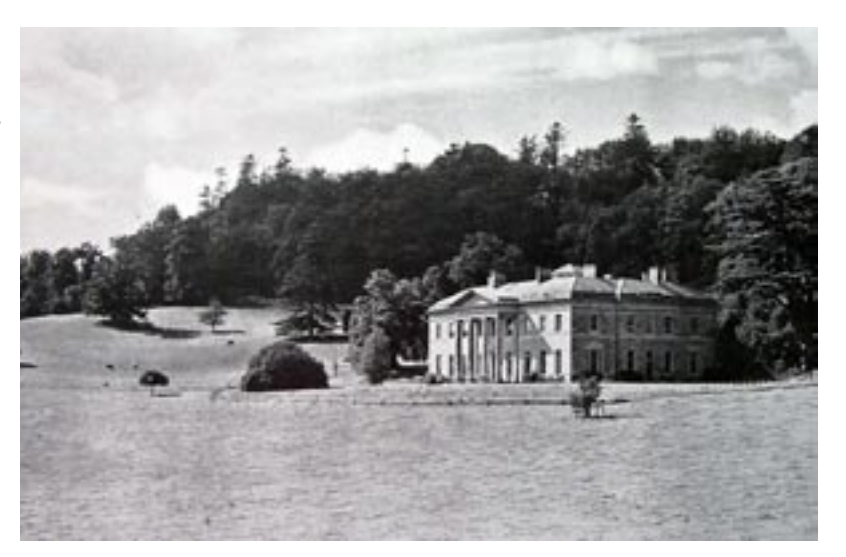
FIGURE 1: A 'Typical eighteenthcentury "landscape" setting' as identified by post war landscape architect Brenda Colvin, Land and Landscape, London: John Murray, 1947.

as 'The greatest English contribution to European architecture. It is one of the greatest aesthetic achievements of England'<sup>2</sup>. More recently, art historian Christopher Woodward has echoed this claim in his writings, arguing that manifestations of a Picturesque imagination can be detected in English poetry, painting and thought from as early as the 1660s, when antiquaries and poets were beginning to show an appreciation of the impact of ancient ruins in the landscape. Woodward comments 'No one "invented" the Picturesque. In retrospect, it can be understood as a confluence of philosophers, poets and painters whose ideas flowed in the same direction'<sup>3</sup>.