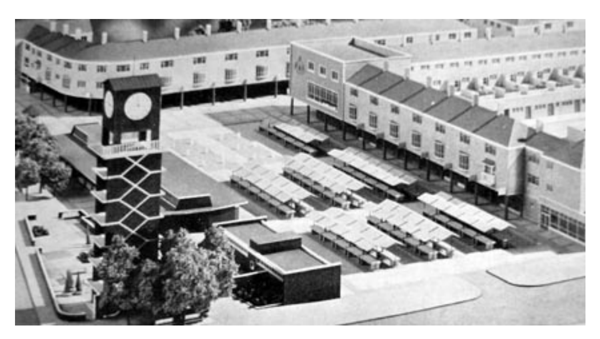
FIGURE 5: The market place and shopping centre at Lansbury, seen from Chrisp Street, designed by Frederick Gibberd, with the clock tower providing a vantage point over the low-rise buildings surrounding it, model, photograph from 1951 Exhibition of Architecture guide, London: HMSO, 1951, p.14.

Beyond the landscape architecture of the South Bank, the Festival designers can also be seen employing a new picturesque in the model housing that formed part of these celebrations. The Lansbury Estate, the Festival's Live Architecture Exhibition, was co-ordinated by the London County Council (LCC) and built in a blitzed area of East London as one of eleven 'neighbourhood units'. The idea of 'neighbourhood units' had been put forward by planner Patrick Abercrombie in his London Plan as a model for structuring tight communities within larger planning masses. This was an idea he had adopted from US planner Clarence Arthur Perry<sup>32</sup>. 'Neighbourhood units' were essentially akin to linked village communities, a popular model for conceptualising London's future development as seen, for example, in Copenhagen town-planner, architect and sociologist Steen Eiler Rasmussen's influential 1934 study: London: The Unique City, when he presented London as 'a group of townships'33.