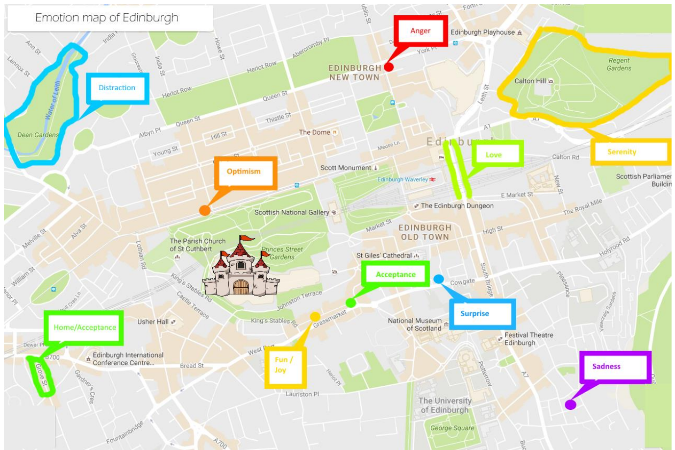
Figure 5: Emotion map of Edinburgh, used as a provocation in a speculative design approach.