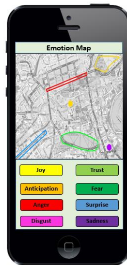
Figure 3: Example of an emotion map based on emotion categories.

Due to the limited insight provided by arousal maps regarding a person’s actual emotions connected to places in the urban environment, more recent studies make use of emotion maps based on emotion categories (Mody, Willis, and Kerstein 2009; Matassa and Rapp 2015; Quercia, Schifanella, and Aiello 2014; Resch et al. 2016). For example, Matassa and Rapp designed and developed a concept for a smartphone app for cyclists called UMap, which aims to enhance people’s reminiscing of past experiences by linking them to the context (i.e. places) in which they occurred (Matassa and Rapp 2015). The mobile app registers contextual data both automatically and by self-reporting. Sensors in the mobile phone are used to automatically collect quantitative contextual data such as time, GPS location and weather conditions. Additional qualitative data such as emotions, notes and media in the form of pictures and videos are not automatically registered, but can be added manually by the user. Emotion maps that do attempt to depict a person’s actual emotions connected to a place (i.e. rather than arousal levels), as the one depicted in Figure 3, typically use simplified emotion categories based on qualitative measurements or crowdsourced data, thus limiting the range of emotions on the resulting emotion map (Mody, Willis, and Kerstein 2009; Matassa and Rapp 2015; Quercia, Schifanella, and Aiello 2014; Resch et al. 2016).