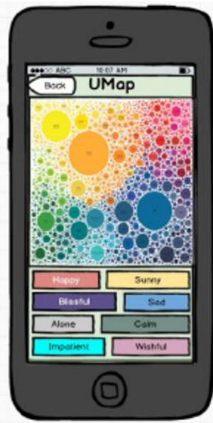
Figure 4: Example of an abstract emotion map based on emotion categories, used in a concept for the UMap app to enable reminiscing.

Although the different types of emotions in the specific emotion categories thus appear to vary across the literature, the emotion categories on an emotion map are typically visualized by assigning a different colour to each of the emotions (see Figure 3). The emotions appear as coloured dots at the relevant locations on the emotion map, or sometimes a user or participant is allowed to define a customized area on the emotion map as well, as can be seen in Figure 3. However, the specific details of the resulting visualizations can differ across the literature as well. In a slightly more abstract emotion map proposed by Matassa and Rapp as part of their emotion map app for cyclists for example, the different emotion categories are depicted by different coloured circles on the emotion map (see Figure 4). The size of the circle could then be used to, for example, depict the intensity of the emotion linked to the memory in that place. Furthermore, the emotion map is interactive, allowing memories and places to be added and removed, and the emotion connected to a place to be changed, thus taking into account the temporality of emotions (Matassa and Rapp 2015).