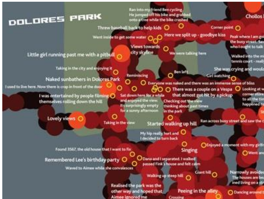
Figure 2: San Francisco emotion map.