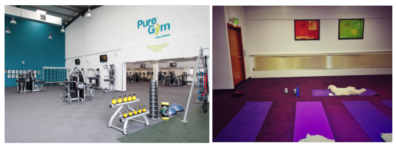
FIG 3: A Pure-Gym yoga space (left); an example of a studio class held in the Chaplaincy (right).

the Yoga Society's classes at "Gathering Essence").