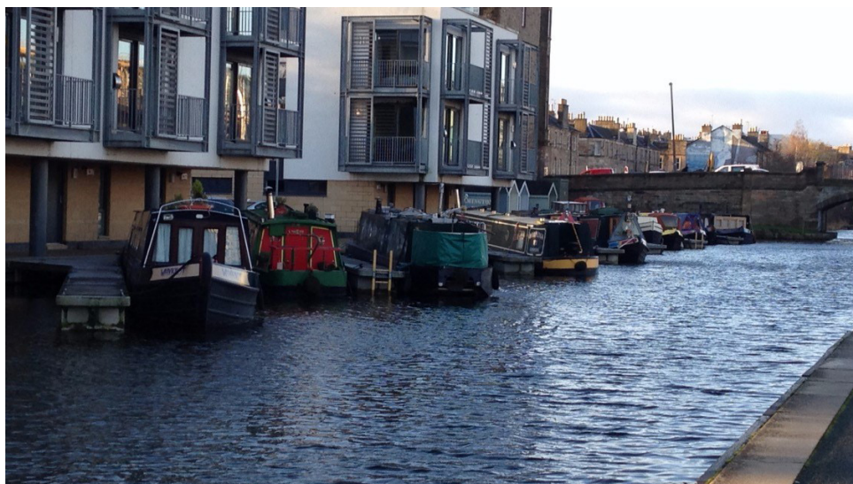
FIG 3: Residential moorings at Leamington Wharf

As said by Lewery, the canal is occupied mainly by 'pleasure boatmen' (1995:43). There are nine boats permanently moored opposite the towpath. They face the construction site, and are situated beneath a block of holiday-let apartments. Adjacent to the towpath, sits the Re-Union boat, the "Lochrin Belle"; a 40-foot, wide beam floating village hall. This area is referred to by Scottish Canals as Leamington Wharf, and is separated from the Lochrin Basin area, which links the canal to Fountainbridge, by the Leamington Lift Bridge.