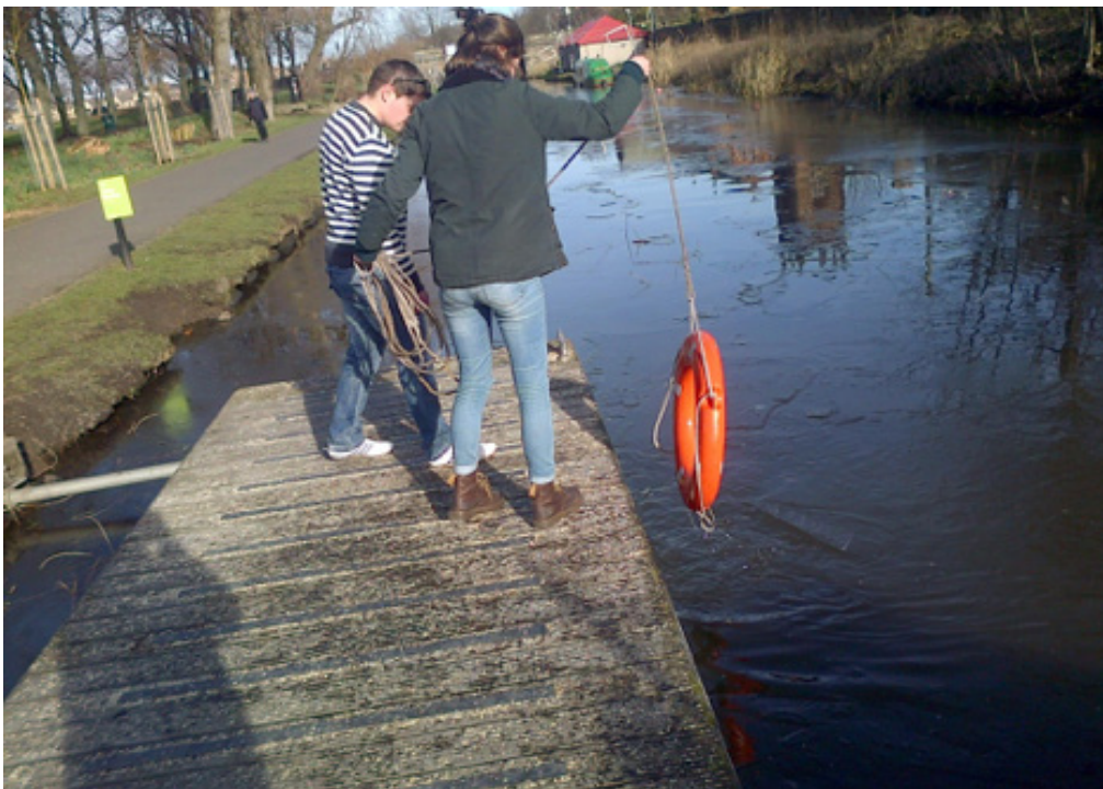
FIG 4: Hospitality training with Re-Union aboard the Lochrin Belle (top); FIG 5: We participated in crew member training every Monday for eight weeks (bottom).