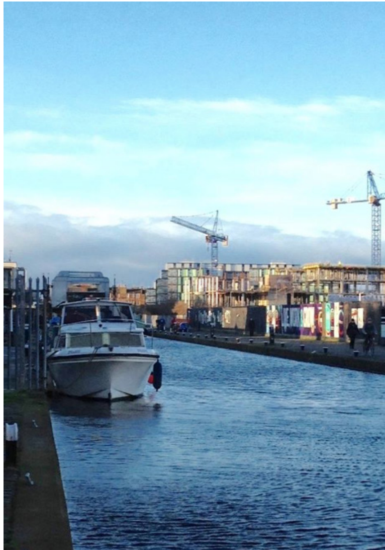
FIG 1: Construction on the canalside

BECCA BOLTON, GIDEON LOVELL-SMITH & LAURA SILOVSKY