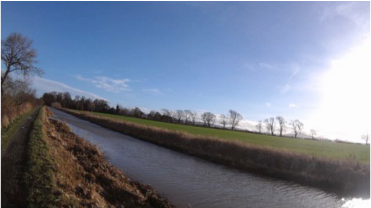
FIG 7: The Union Canal