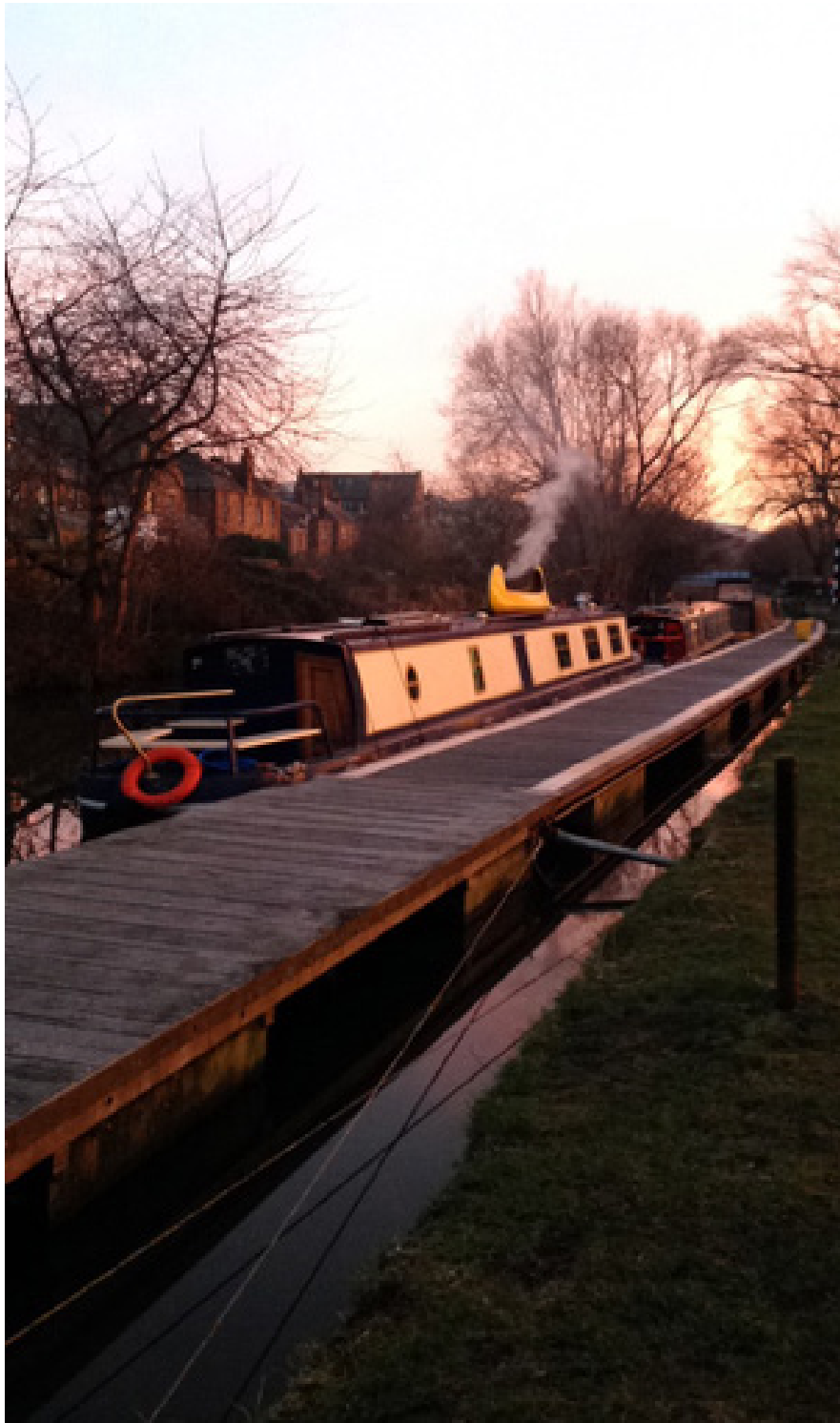
FIG 6: The narrowboat that we stayed on during our fieldwork.