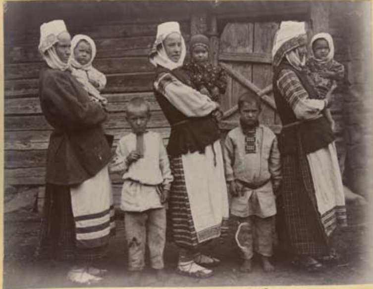
Мавриус и гомбасир (Термандури)