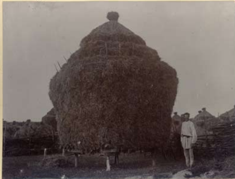
Смивар келба на румин.