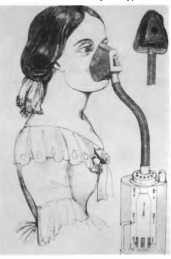
A drawing of an early inhalational general anaesthetic apparatus.

found that patients attended by a doula had shorter labours, a lower Caesarean section rate and a lower oxytocin augmentation rate. Further more, their babies required intensive care less often. Transcutaneous Electrical Nerve Stimulation (TENS) is now another popular analgesic method. particularly in the early part of labour. This with achieved simple equipment operated by the mother to stimulate endorphin release and to block