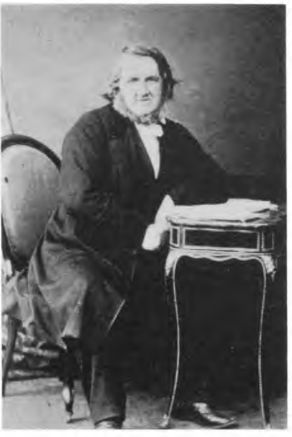
Figure 1. Sir James Young Simpson, the father of obstetric anaesthesia.

Twilight Sleep, was introduced; this was achieved by administering morphine with hyoscine. In a long labour the hyoscine was repeated but not the morphine. Thus the pain returned, but the hyoscine, providing amnesia, clouded the unpleasant memory. In 1913 Gwathmey described the use of colonic ether in oil, which was used until the 1950s.