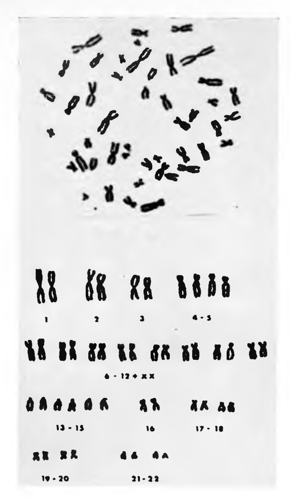
Fig. 2. Cell and Karyotype from a culture of the peripheral blood lymphocytes of a normal female.