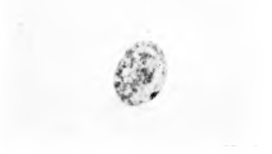
Fig. 3. Cell from the buccal mucosa of a normal female showing a single sex chromatin body (Barr body).

group 21-22 results in the profound disturbance of virtually every system in the body characteristic of mongolism. On the other hand the presence in an individual of an additional Y chromosome, which is of a comparable size, may be associated with no phenotypic abnormalities at all.