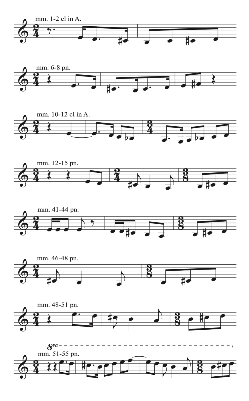
Figure 7: Motive a

characteristics during the music, providing a brilliant sonority when audiences listen to this piece. While initially it seems that many fragmented motives are intertwined in an irregular way, careful analysis reveals that these themes are organized to create a regular pattern.