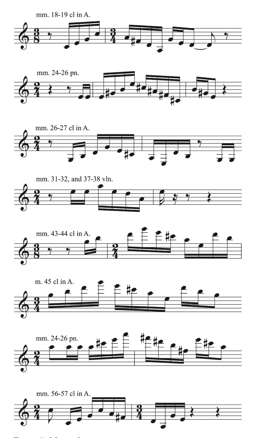
Figure 7: Motive b