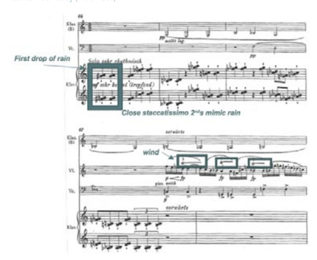
Figure 1 Hanns Eisler: Fourteen ways to describe Rain Pictured modified by (Eisler 1960)

[1] Berndt Heller. 'The Reconstruction of Eisler's Film Music: "Opus III", "Regen" and "The Circus". Historical Journal of Film, Radio, and Television 18, no. 4 (1998): 550.