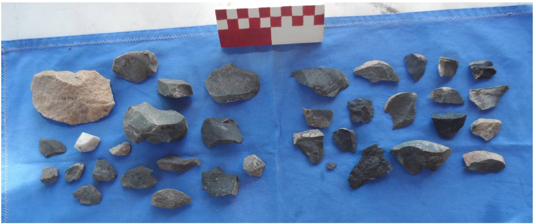
Figure 7. To the left archaeological material, to the right experimental products. Notice similarities regarding objective pieces and distal end of flakes. The scale bar is 10 cm wide (in ten 1 cm segments).