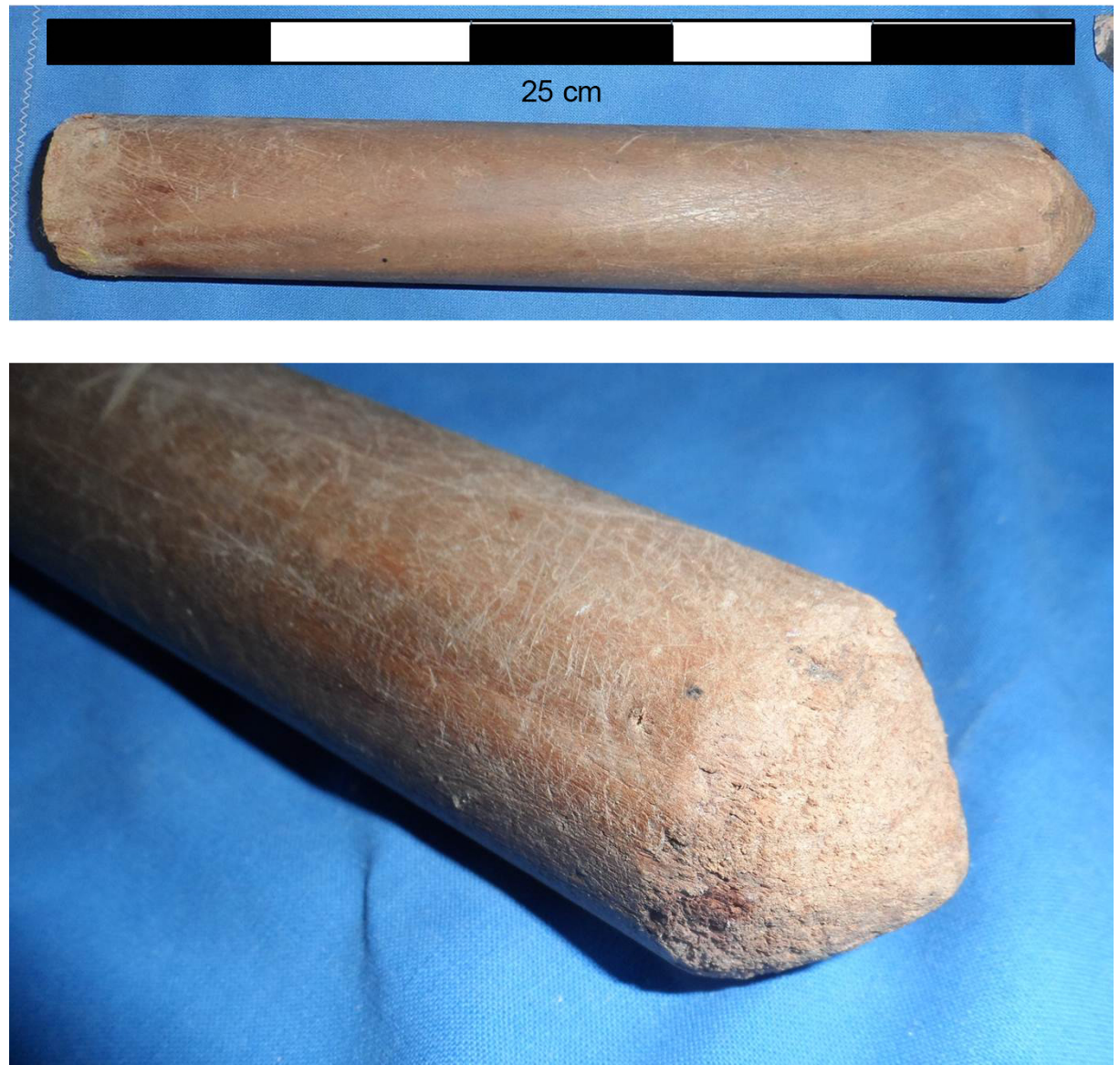
Figure 6. Quina billet after being used. Notice the wearing. The scale bar is 25 cm long (in 5 cm segments).