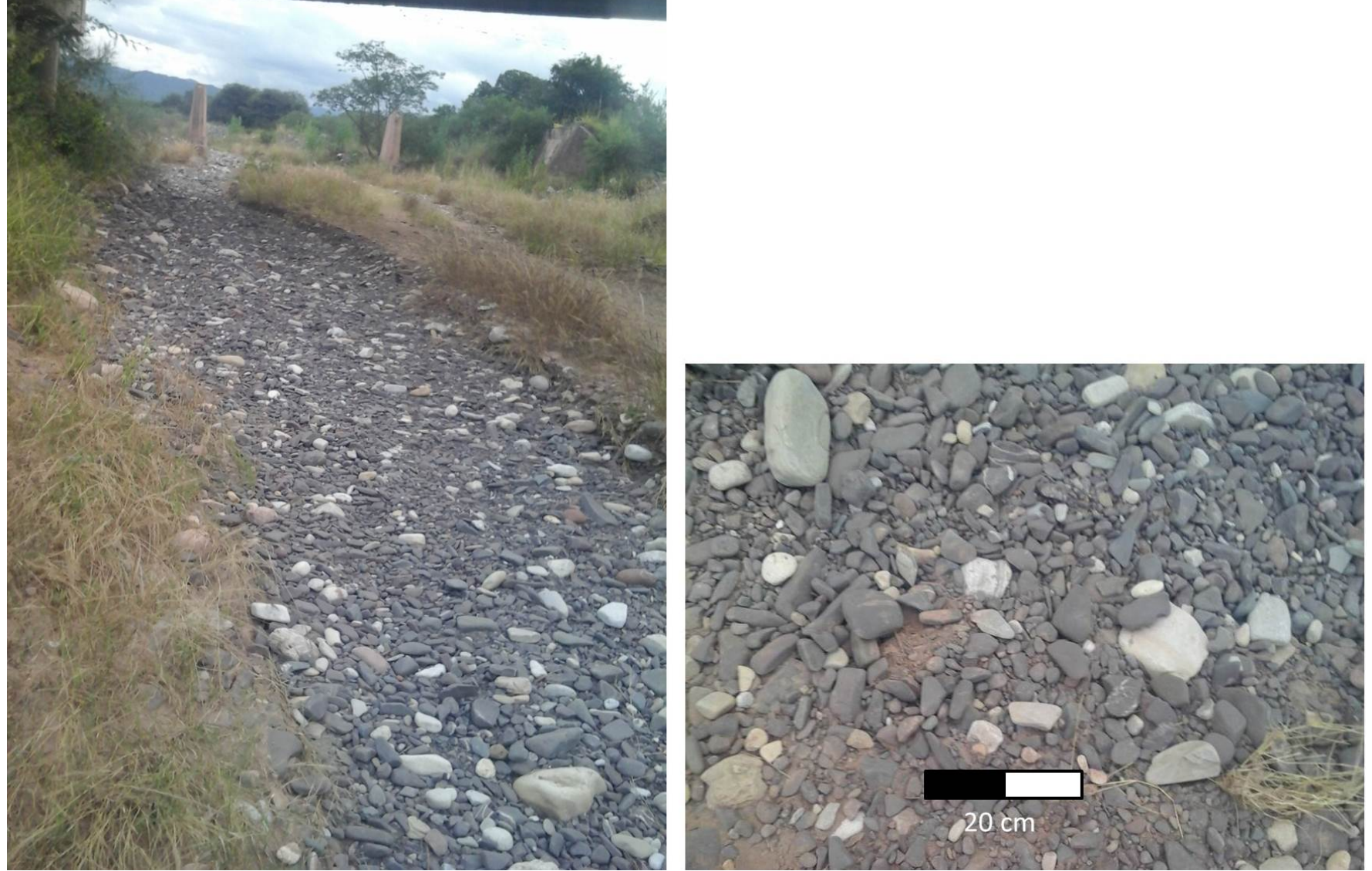
Figure 5. View of dry runway of Ampascachi river and detail of available rocks. The scale bar is 20 cm wide (in two 10 cm segments).

Journal of Lithic Studies (2018) vol. 5, nr. 2, 23 p.