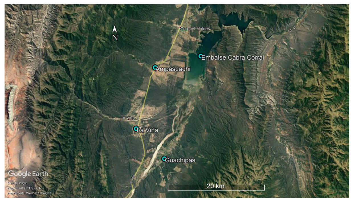
Figure 2. Map with towns from which the samples were collected. (See the KMZ supplementary file for details.)

Archaeological sites under study are located specifically in La Viña department and border with Guachipas town. Even though this town lacks a meteorological station and information is from Talapampa and Ampascachi (south and north respectively) it may be asserted that the weather corresponds to tropical serrano with dry season. Even though precipitation average is about 450-500 mm a year, in the summer these can be torrential, focusing between November and March, being intense and short with very variable precipitation values in time span (Moya Ruiz 1989). Prevailing winds come from E and NNE (Alonso et al. 2000; Gelli 1990, among others). Between April and September weather is cold to mild and warm to mild weather the rest of the year, and the average temperature per year is 19.2°C, with a maximum of 41.8°C and a minimum of -4.5°C (Moya Ruiz 1989).