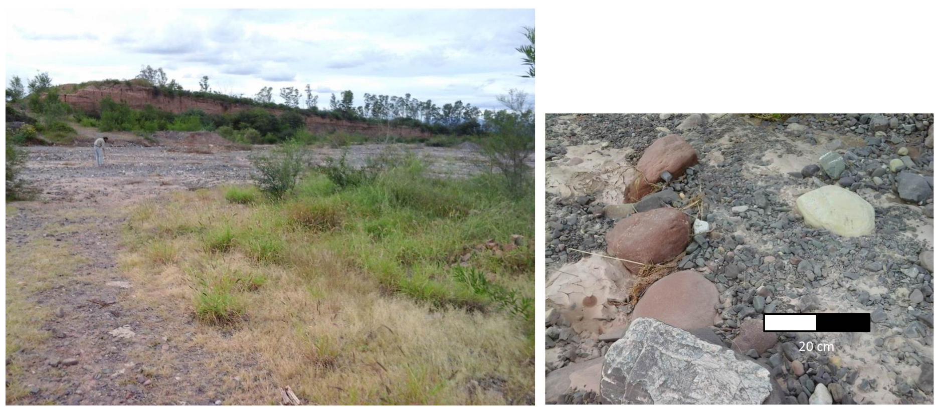
Figure 4. View of La Viña river and detail of available rocks. The scale bar is 20 cm wide (in two 10 cm segments).