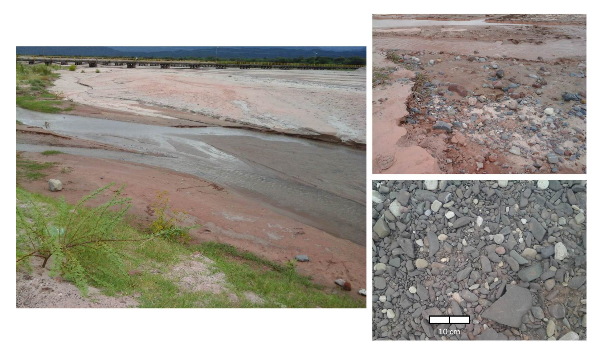
Figure 3. View of Guachipas river and rock availability. The scale bar is 10 cm wide (in two 5 cm segments).

Journal of Lithic Studies (2018) vol. 5, nr. 2, 23 p.