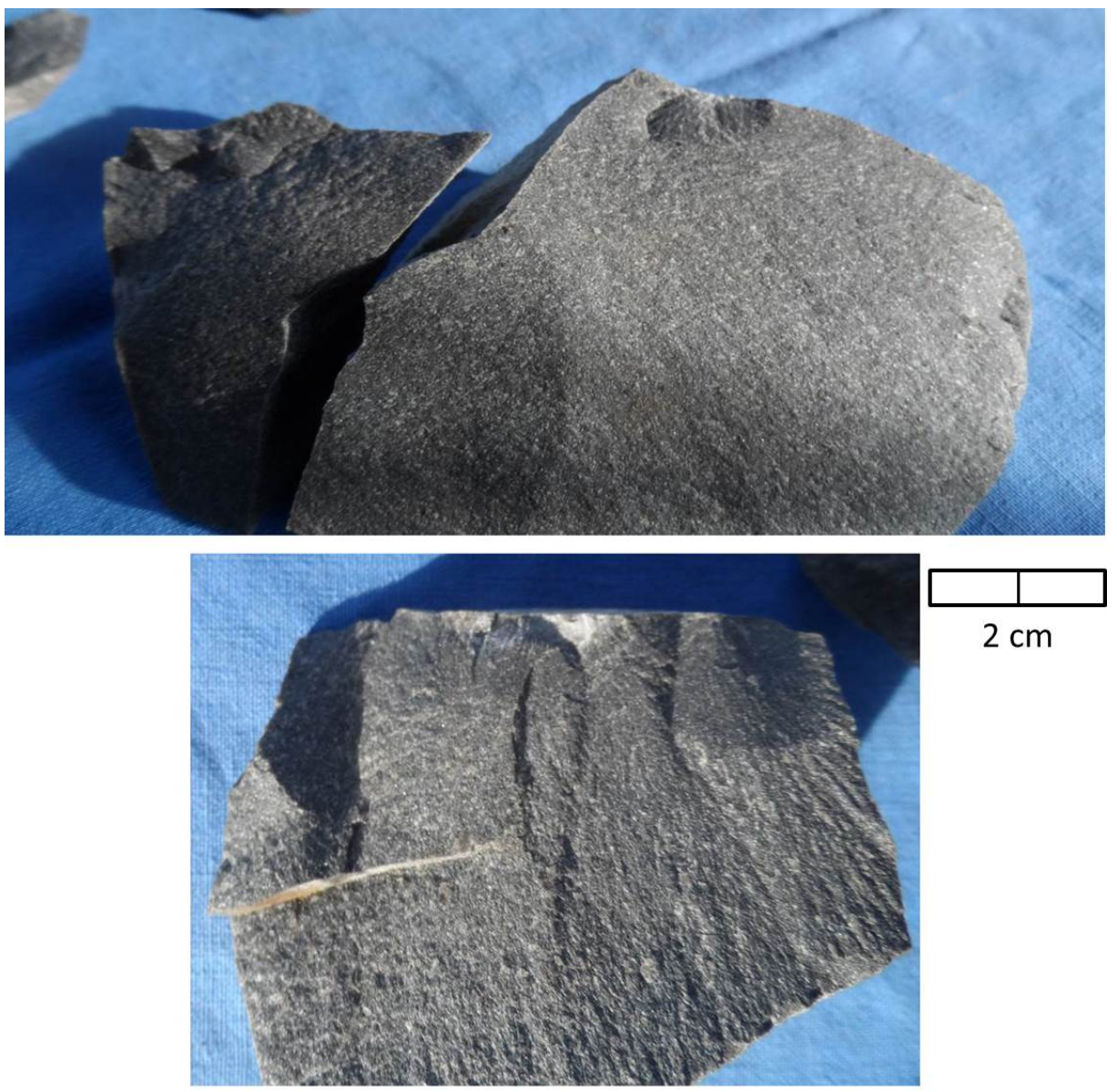
Figure 8. Double and triple bulbs in experimental material. The scale bar is 2 cm wide (in two 1 cm segments).