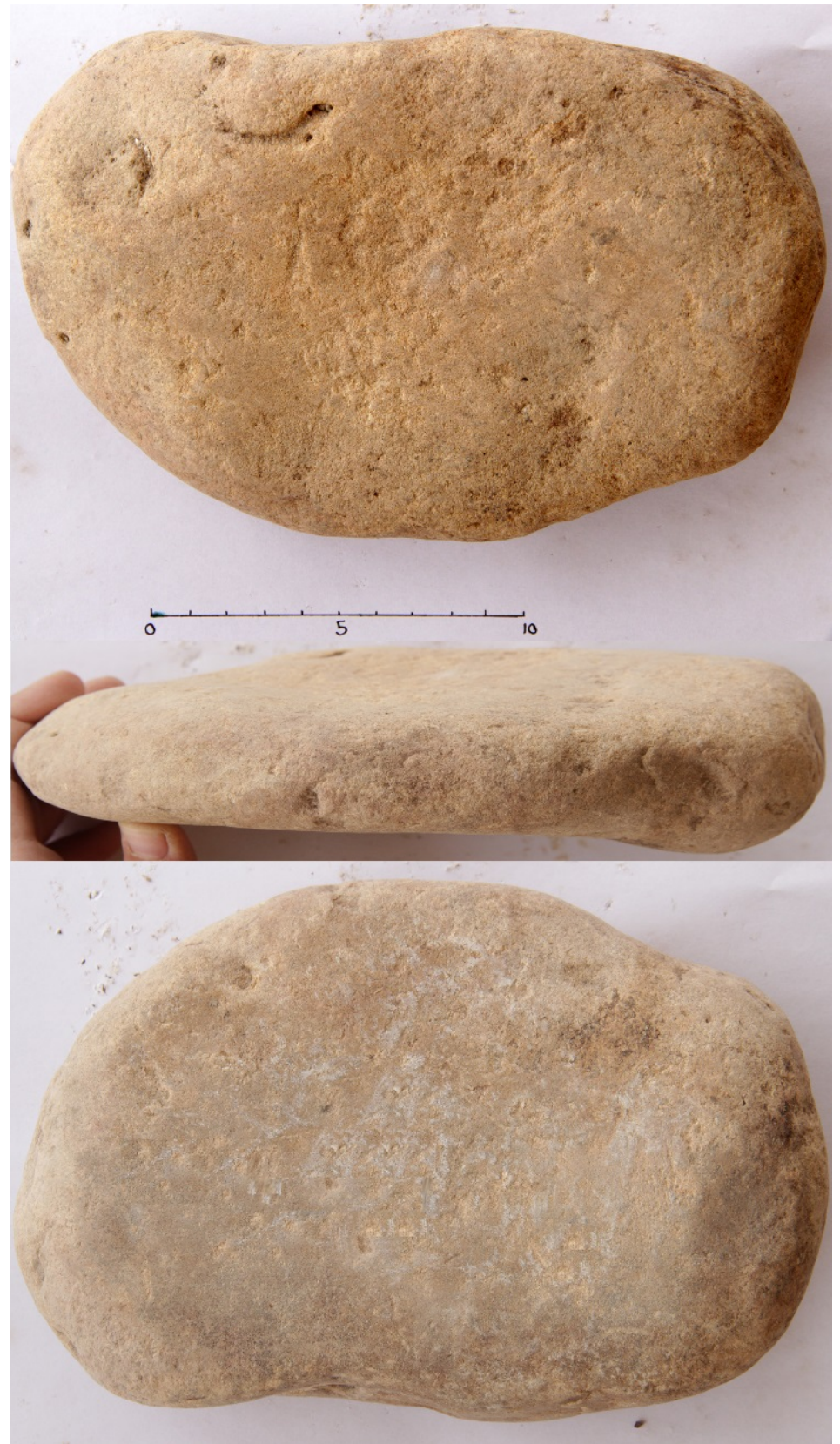
Figure 4. Stone 3.

Stone 3 is a sandstone grinding stone, somewhat heart-shaped with slightly worn out pits (Figure 4). It lay in a material that contained a few patches of ochre directly above a surface of Building 11 (Stratum I).