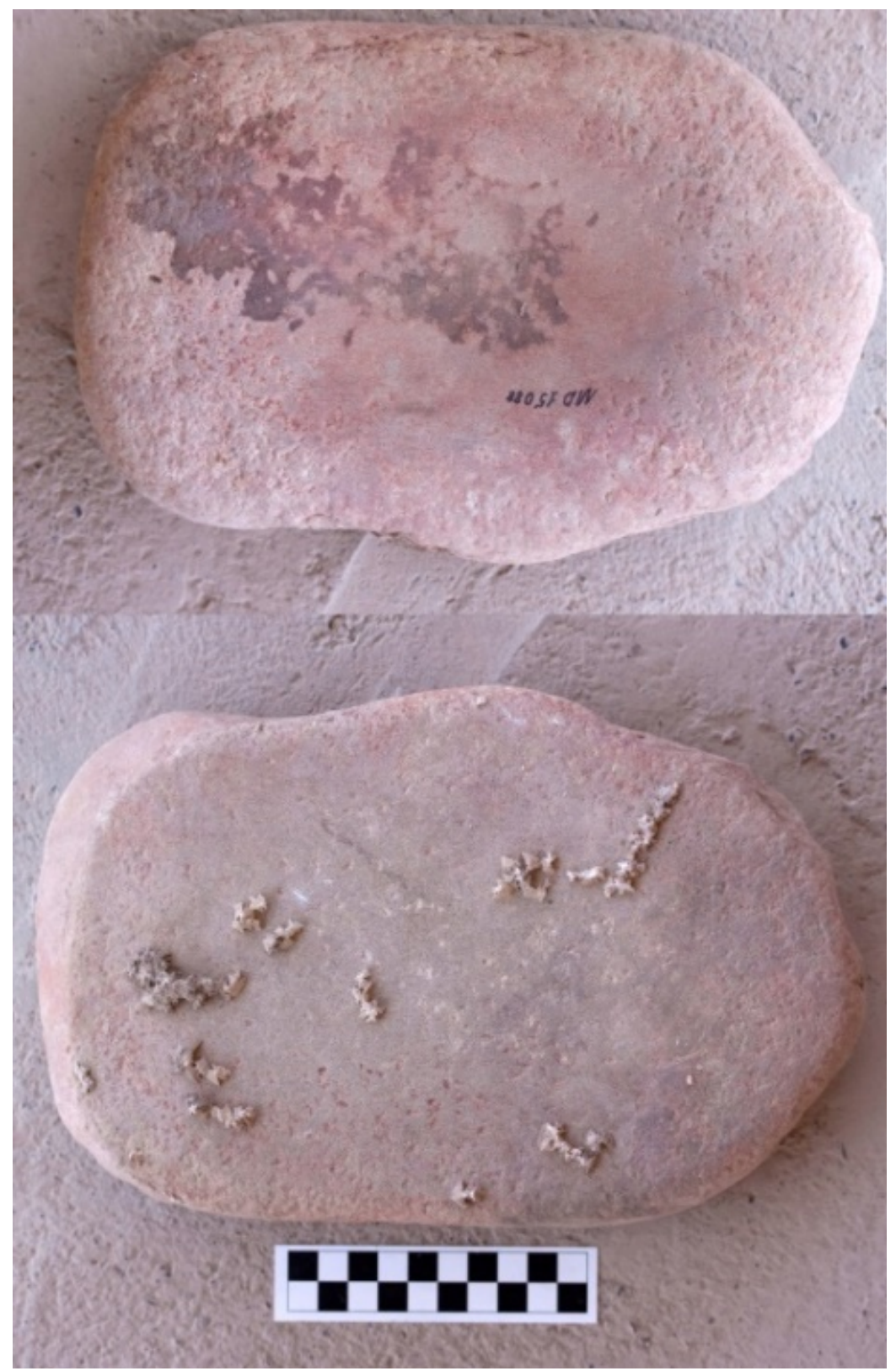
Figure 6. Stone 5, front (top) and reverse side (bottom).

Stone 5 is grinding stone made of sandstone, with worn out pits and fully covered with a thick layer of ochre (Figure 6). The use traces indicate that both sides were used. It was found in the debris of a collapsed wall amongst sizeable pieces of mudbrick in the southeastern room of Building 14 (Stratum IV).