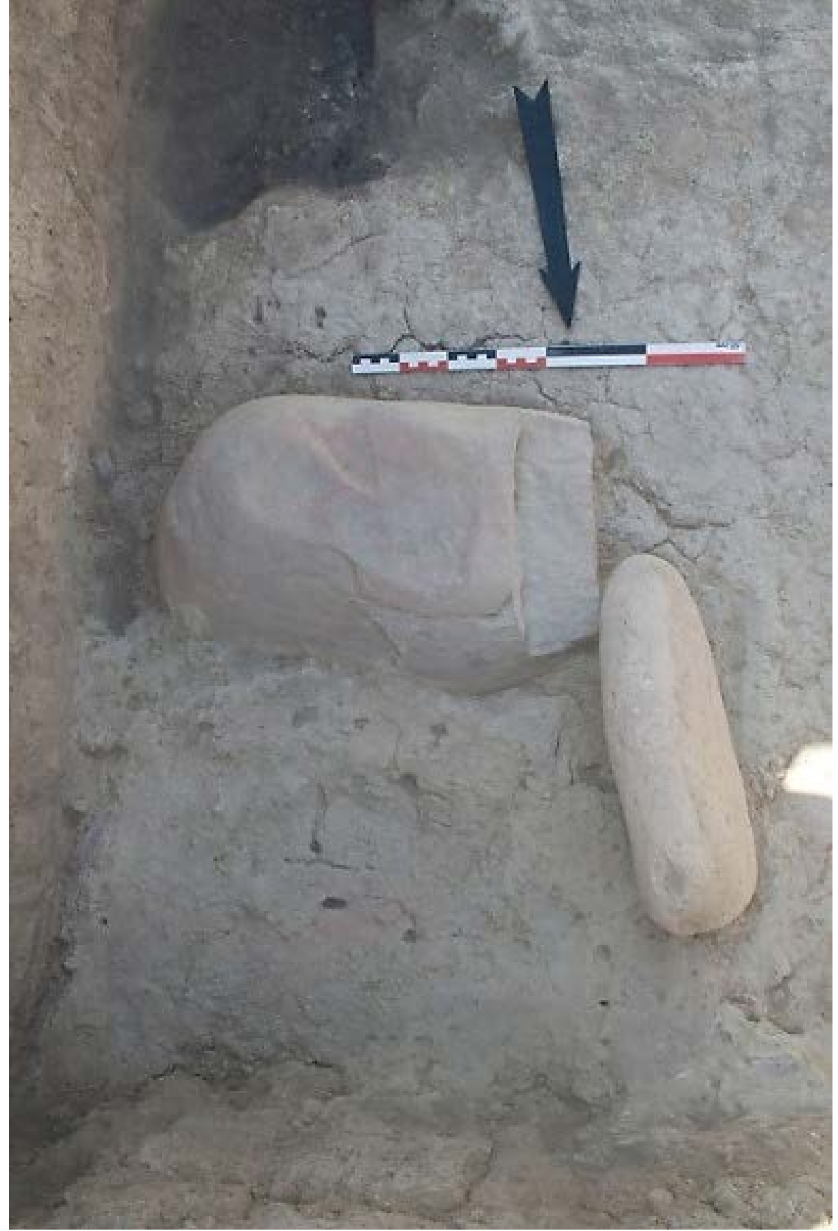
Figure 3. Stones 1 (larger) and 2.

Journal of Lithic Studies (2016) vol. 3, nr. 1, p. 359-377