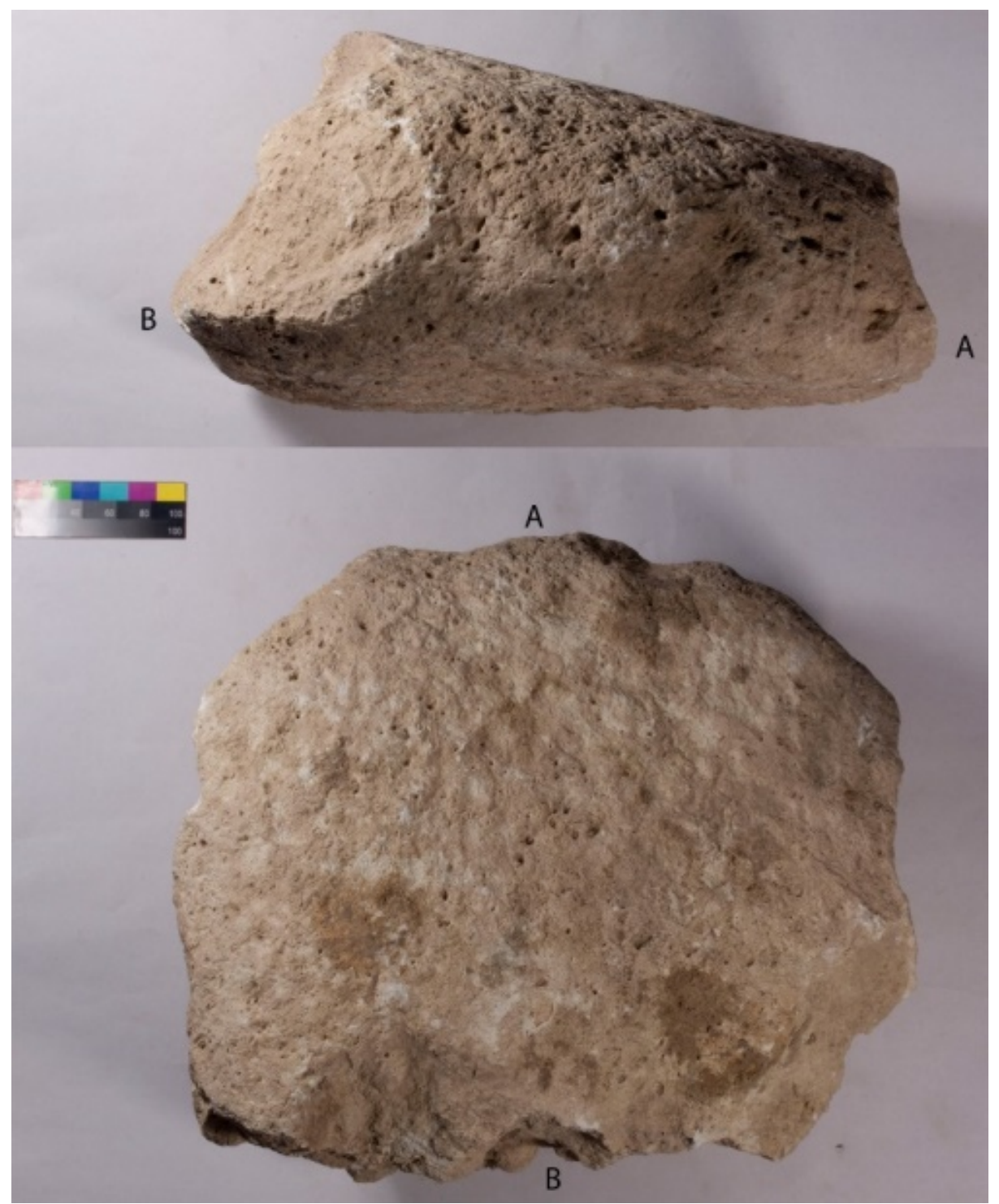
Figure. 5. Stone 4.

Stone 4 is a square shaped coarsely worked limestone with a slight depression in the middle (Figure 5). Pecking traces are visible outside of the depression. No traces of ochre were observed. The very rough surface of one of the edges (in Figure 5 side B), when compared to the elaborate processing of the other parts of the stone and the triangular profile, suggests that this stone is a broken (in Figure 5. B would be the broken edge) handstone that was then re-used for another purpose. This broken edge was worked only roughly, if at all before the slight depression was made. This stone was found on a floor in the north-western room of building 15 (Stratum I) near a wall close to a street.