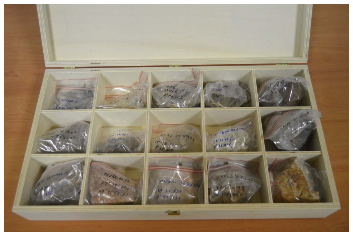
Figure 2. Custom-made poplar wood boxes with some of the hand geological samples from LusoLit.

In regards to the storage of the samples, the subdivision of larger nodules makes the individuals to fit into a maximum size of 7x8x5 cm that is the size of the slots in custom made poplar wood boxes (Figure 2). This subdivision creates samples for future analysis such as heat treatment and burning. The remaining volume is kept as reserve for future samplings such as thin sections. The poplar wood boxes are stored in steal shelves, while the larger blocks are stored in standard industrial plastic boxes. Each specimen has a specific slot in a specific wood box where a physical tag is added with part of the information related to the source. The specimen receives coordinates again in order to create redundancies and avoid mixing.