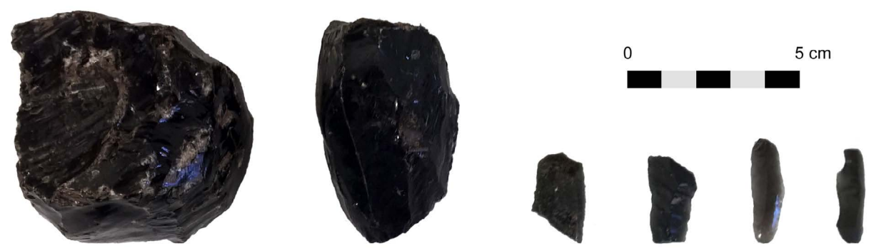
Figure 3: Artifacts from San Leonardo di Cutro, near Crotone, Calabria. Prepared cores (see particularly the second artifact from left for a core partially used to produce blades as those to the right) are frequent in Calabria, unlike Sicily.

The nearly absolute absence of indigenous types merits further consideration. Given the broad range of distribution of Lipari obsidian since the Early Neolithic, it comes to no surprise that areas with different lithic traditions were interested by the exchanges. Yet, no