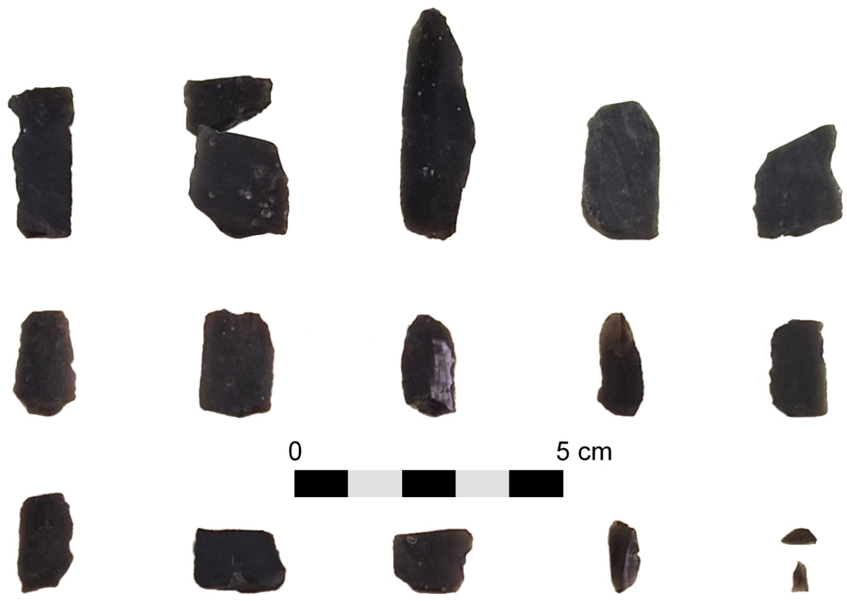
Figure 2: A sample of Lipari obsidian assemblages. The small assemblage found from surveys (Middle to Late Neolithic) at 'Npisu and conserved at Sant' Angelo Muxaro, near Agrigento, Sicily. Despite the closer proximity with Pantelleria, and the presence of significant quantities of Pantelleria obsidian at some sites, just one of fourteen analyzed artifacts (last two bits were excluded) comes from Pantelleria: the second tool from the left in the last row.

in modern museums are often deceiving, because they suggest a high visibility or separation of the artifact from other lithics and artifacts. In a few cases cores from raw obsidian are found in centers for local working and redistribution, and these assemblages together with the cargoes of traveling obsidian were the only contexts in which obsidian was prominently visible and distinct from other materials.