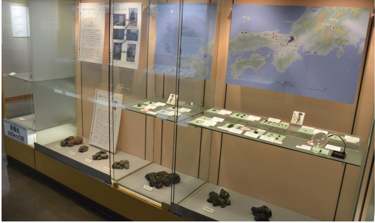
Figure 3. Obsidian exhibition section "Obsidian, 600 km Journeys".

Even considering only major sources, the Japanese archipelago has approximately 200 obsidian sources (Figure 4), a situation owing to the geological background as the part of circum-Pacific volcanic belt. Obsidian sourcing studies have become some of the most important research areas to demonstrate some form of ancient trade. Some researchers have tried to utilize INAA (Ninomiya et al. 1993) and ICP-AES (Miura et al. 2012) for sourcing, but the majority focus on minor elements detected by XRF. EDXRF in particular, is the most popular method in sourcing studies of obsidian artifacts because it is a non-destructive and inexpensive method for analysis. Owing to the progress of analytical instruments and provenance analysis methods, it has been possible to accumulate sourcing data for all lithic artifacts within an assemblage, including debris, in order to obtain quantitative information