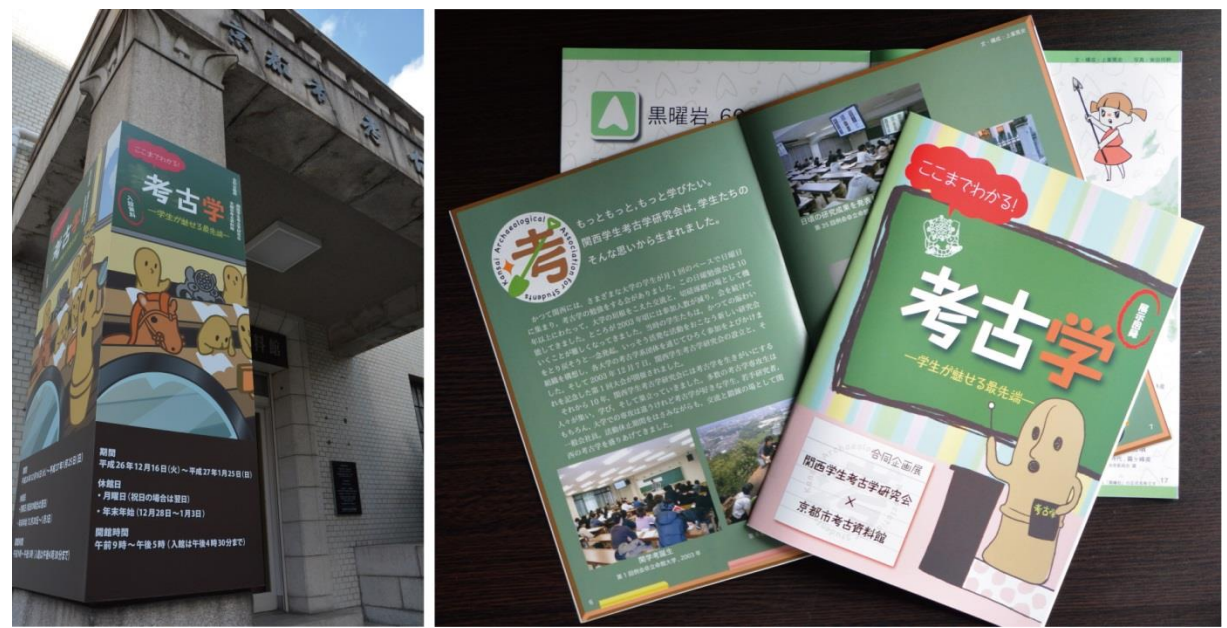
Figure 2. Signboard and pictorial record book designed by the students of Osaka-Seikei University.