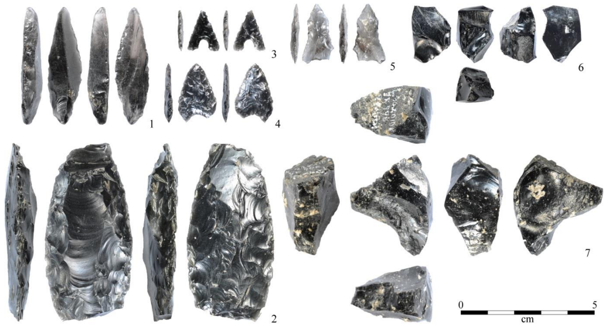
Figure 5. Obsidian artifacts unearthed in Kansai region, Japan. 1. Backedblade from the Gokasyo-Futagozuka site, Upper Palaeolithic Period, Nishi-Kirigamine series obsidian (owned by Uji City Board of Education). 2. Point from the Rokuya site, possibly Incipient Jomon Period, Oki Island series obsidian (owned by Kameoka City Board of Education). 3. Arrowhead from the Oyugo-Arahori site, Early Jomon Period, Oki Island series obsidian (owned by Fukuchiyama City Board of Education). 4. Arrowhead from the Keshikedani site, Early Jomon Period, Oki Island series obsidian (owned by Fukuchiyama City Board of Education). 5. Arrowhead from the Kitaochi site, Final Jomon Period, Nishi-Kirigamine series obsidian (owned by Shiga Prefecture Board of Education). 6. Thermal fractured piece from the Ishida site, Final Jomon Period, Osaki Peninsula series obsidian (owned by Muko City Board of Education). 7. Thermal fractured piece from the Kaide site, Final Jomon Period, Koshidake series obsidian (owned by Muko City Board of Education).

obsidians were transported over long distances ranging from approximately 200 to 600 km. The result prompted the author to try to determine their age by diverse methods. As is often the case with Neolithic archaeology, lithic artifacts are dated on the basis of the relative chronology of pottery which accompanied them. This time, the author cross-checked the age of the obsidian artifacts with the research on lithic typology and technology and with research on the temporal change in lithic raw material utilization patterns, as well as with the pottery chronology. Additionally, the edge sharpness and the degree of damage to flaking surfaces were observed very carefully. They could be considered as "transportation damage" and suggest where the obsidian artifacts were made.