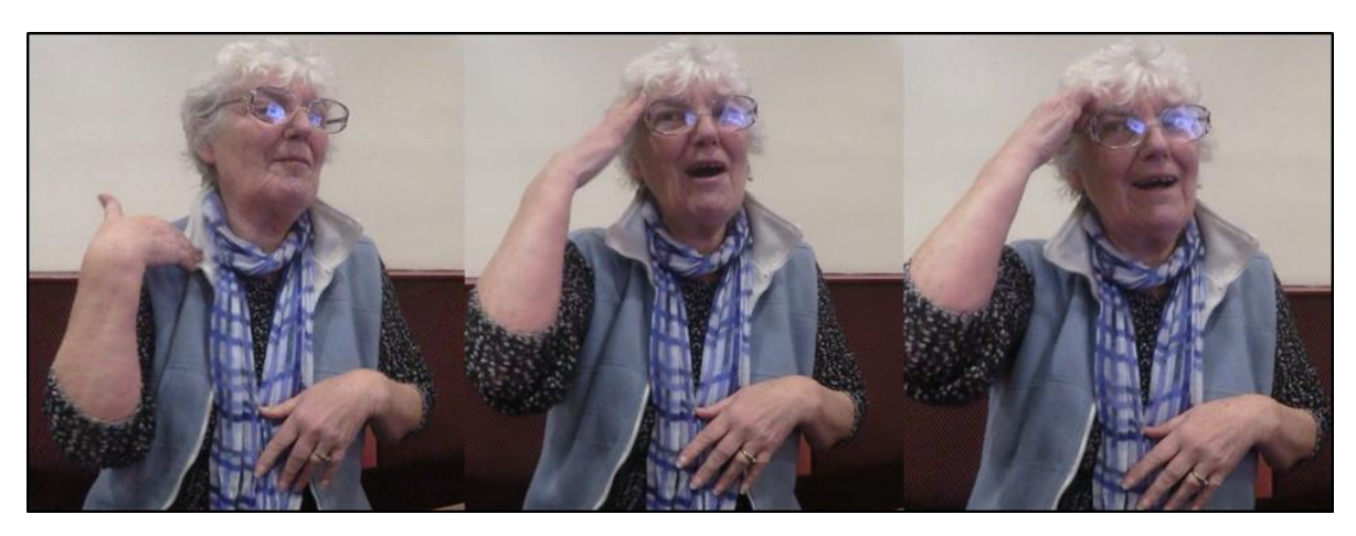
Figure 2: Example of lexical variants of 'America'.

To determine lexical variation in BSL in Leeds, signs were also coded as either 'traditional' or 'non-traditional'. As there is no current research on the use of BSL in Leeds, traditional signs were determined through an analysis of existing signs in BSL. Signs were compared to those that have been and are associated with a particular region, described in the literature of lexical dictionaries (Brien 1992), the BSL Corpus, and earlier research (Woll et al. 1990). The BSL SignBank (see Fenlon et al. 2014) provides a visual denotation of BSL signs, along with each