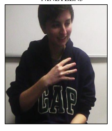
Figure 4: Example of number variants 'Nineteen' in BSL.