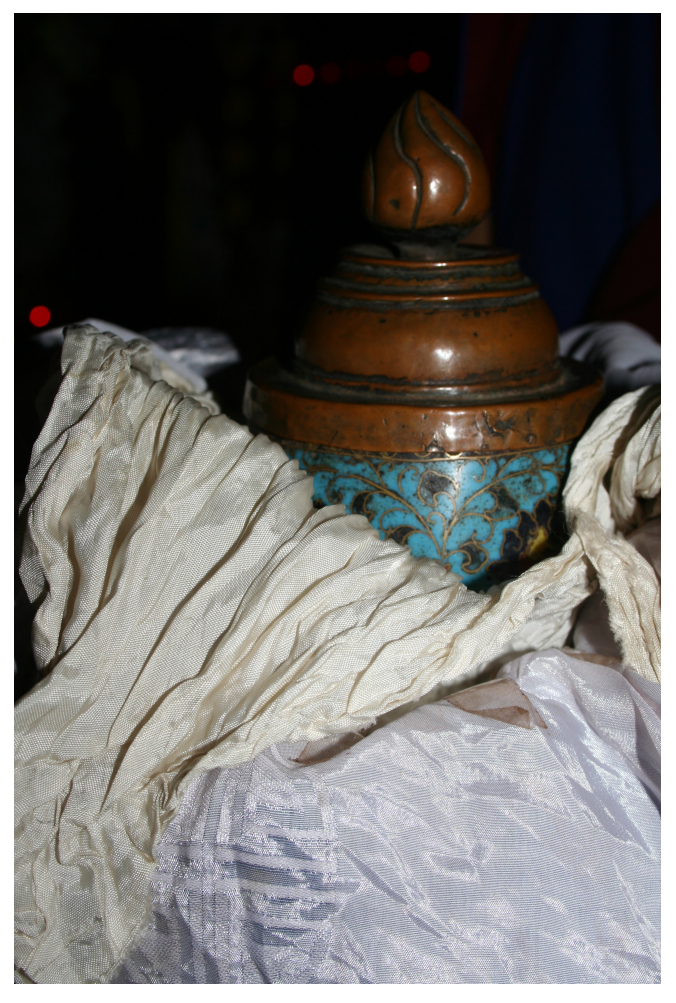
Figure 2. The papta 'fermenting agent' of the mendrup ritual in its ornamented cloisonné vase. As a sign of respect, it is kept wrapped in a white Tibetan ceremonial scarf, khatak (kha btaqs). The papta guarantees the potency and thus efficacy of the ritual.