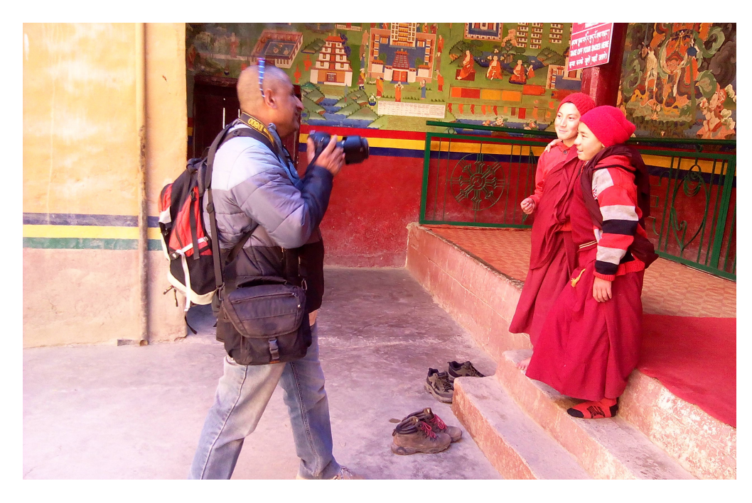
Figure 2. Tourist photographing two boy-monks in the Lamayuru monastery courtyard.