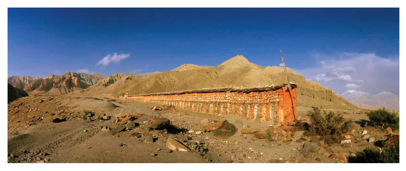
Figure 3: Maldang Ringmo, one of the longest walls of mani stones in Nepal, located between the villages of Ghami and Drakmar. This wall of carved prayers is also considered to be the intestines of the demoness that Guru Rinpoche defeated in his quest to transmit Buddhism to the Himalaya. The gray cliff beyond is her liver and the red cliffs in the distance are said to be her blood.

through the purported discoveries of texts related to him. These included the first hagiography of Padmasambhava, The Copper Island Chronicle (Bka' thang zangs gling ma) revealed by Nyangrel Nyima Ozer (1124 or 1136-1192 or 1204, see Hirshberg n.d.; Doney 2014). The twenty-first chapter of this work involves a conversation between Padmasambhava and the emperor Trison Detsen in which the former foretells a time when his hidden treasures will be discovered and used to thwart a precipitous decline of the religion. Mongol incursions during the 13^{th} and 14th century prompted a fresh round of prophesies forecasting the decline of Buddhism. For example, the Five Chronicles (Bka' thang sde lnga) discovered by Orgyan Lingpa (b. 1323) contains a section titled "how the end of time will come."2