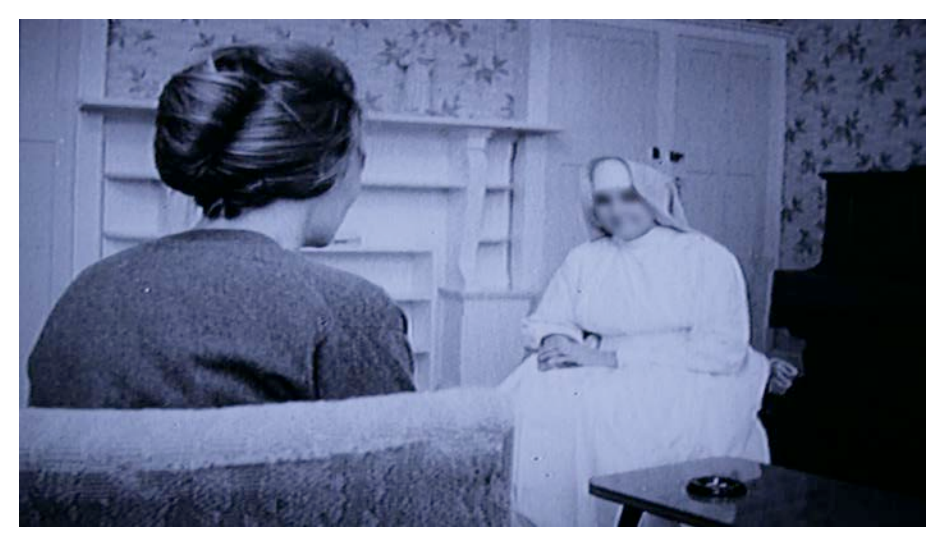
Figure 4: Still from The Distorted Image: Mental Hospitals. New Zealand Broadcasting Commission, 1968.

In 1957, newspapers across the country informed readers that mental hospital patients were now accommodated within "self-contained units with dormitories, dining rooms and kitchens and well-furnished day rooms.... [set] amid beautiful lawns and gardens" ("More Psychiatric Nurses Are Needed"; "Psychiatric Nursing is a Rewarding and Interesting Career"; "Northland Has Considerable Interest"). Interior details about these new residences were given: chairs were "leather-upholstered," rugs were "attractive" and curtains were "tasteful" (Division of Mental Hygiene, "Male Attendants See Many Changes"). In addition to the articles written by the Division's own journalist, hospital superintendents were encouraged to invite journalists from local newspapers to visit and tour their hospitals. The focus on domesticity within these articles was consistent with those produced by the Division. A reporter from the New Zealand Herald, for example, wrote that at the Auckland Mental Hospital, first constructed in 1867: "walls which used to be covered by depressing brown paint now glow with the pink, blue and gold tints of the home decorator's brush" ("Our Mental Hospitals"). Similarly, a journalist for the Otago Daily Times went further, observing that the kitchens at the new Cherry Farm Hospital boasted plentiful cupboard space and labor-saving devices, such as giant cake mixers and large refrigerators ("Attractive New Otago Hospital Villa").