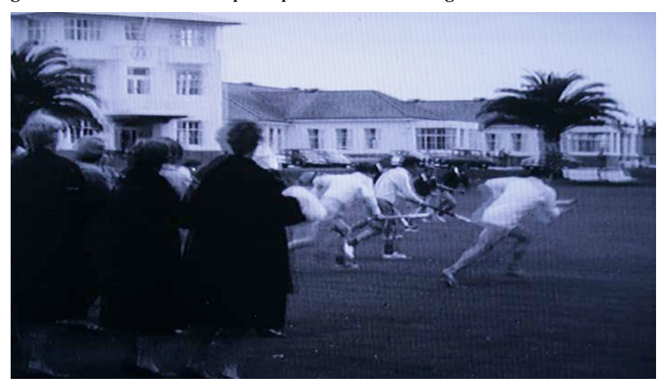
Figure 8: Still from The Distorted Image: Mental Hospitals. New Zealand Broadcasting Commission, 1968.

Kingseat, members of the public, helpfully distinguished by the expensive-looking winter coats they wear, are seen standing on the sidelines (Figure 8). Like the footage of visitors arriving at Kingseat, these images reassured viewers that members of the public were already in attendance at New Zealand's mental hospitals. By extension, if visitors were now welcome inside these previously guarded institutions, then perhaps there was nothing to hide there.