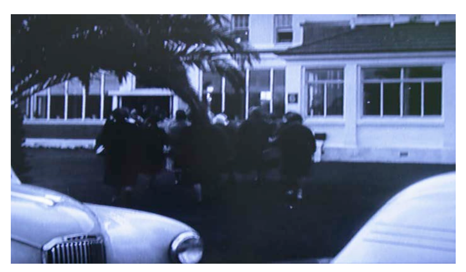
Figure 6: Still from The Distorted Image: Mental Hospitals. New Zealand Broadcasting Commission, 1967.

In 1953, The World Health Organization [hereafter WHO] released a report on the future of mental healthcare that further extended the idea of the open door hospital (earlier defined). It called for better engagement with the community beyond the hospital, acknowledging that visitors to mental hospitals were often restricted to "specially prepared and segregated visiting rooms." This was no longer to occur (WHO, 18). It also stipulated that, where suitable, patients were to be encouraged to accept jobs outside the hospital. Hospital boundaries were to be made easily traversable in both directions; both patients and the public should be free to come and go as they pleased (WHO, 22).