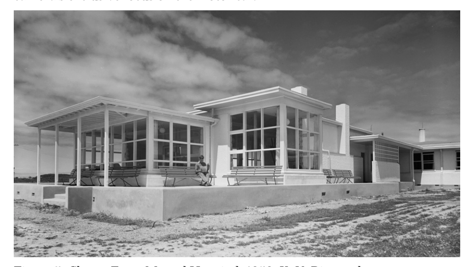
Figure 7: Cherry Farm Mental Hospital, 1953.

The visitors scene at Kingseat was not the only instance of an existing mental hospital being framed using the movement of automobiles to suggest modernity and freedom of movement. A sequence filmed in front of the Auckland Mental Hospital shows a number of cars pulling into the hospital's car park while others join the line of traffic on the adjacent city street. The continual coming and going of motor vehicles animates the ordinarily static facade of Auckland's nineteenth century asylum building. The limitations of this outdated facility, the impenetrability of endless brick punctuated by small windows and one single, controlled point of entry was rendered irrelevant by the camera's exclusive focus on the motor car.