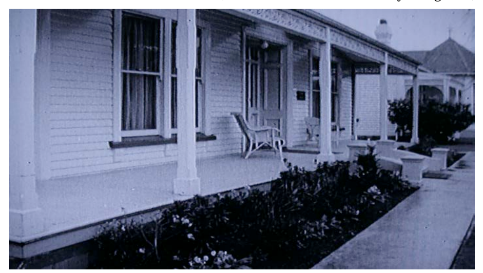
Figure 5: Still from The Distorted Image: Mental Hospitals. New Zealand Broadcasting Commission, 1968.

tell us that the modern mental hospital is practically indistinguishable from the domestic abode. Indeed, we can see it for ourselves (as we do when we look closely at Figure 5).