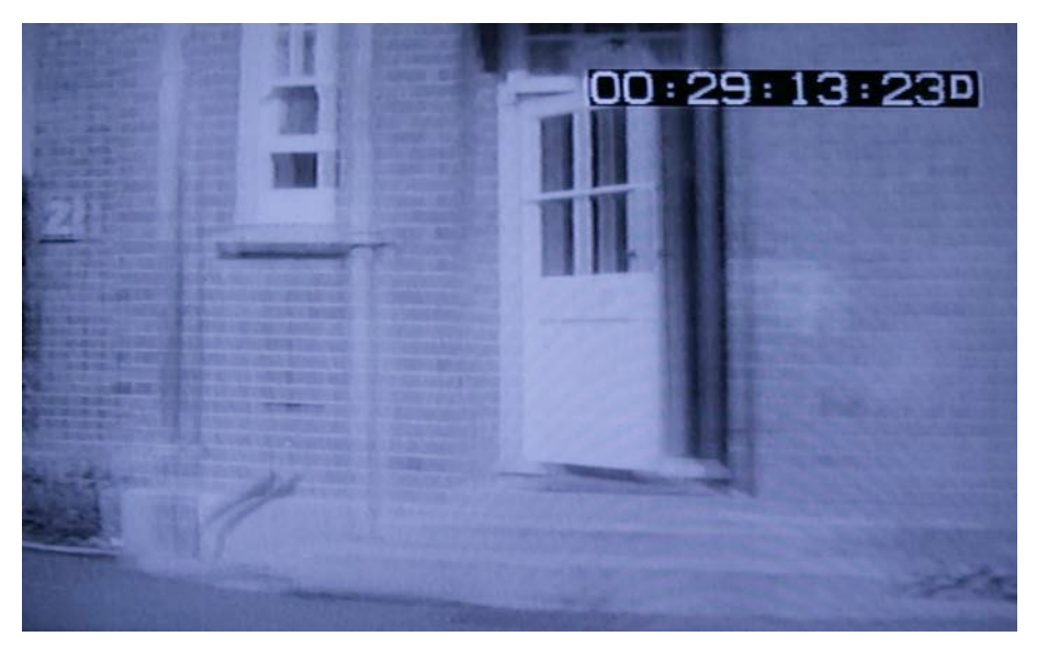
Figure 10: Still from Compass: Mental Health . New Zealand Broadcasting Commission, 1967.

A narrow shard of air between a door and its frame is a seemingly insignificant detail. Yet, the Division of Mental Hygiene had even this aspect firmly under their editorial control. The producers of Compass cannot have been remotely pleased by the footage the Division allowed them to shoot within the grounds of Kingseat. The anodyne nature of this footage and the recurring image of open doors quietly but assuredly undermined the ferociousness of the criticism delivered.