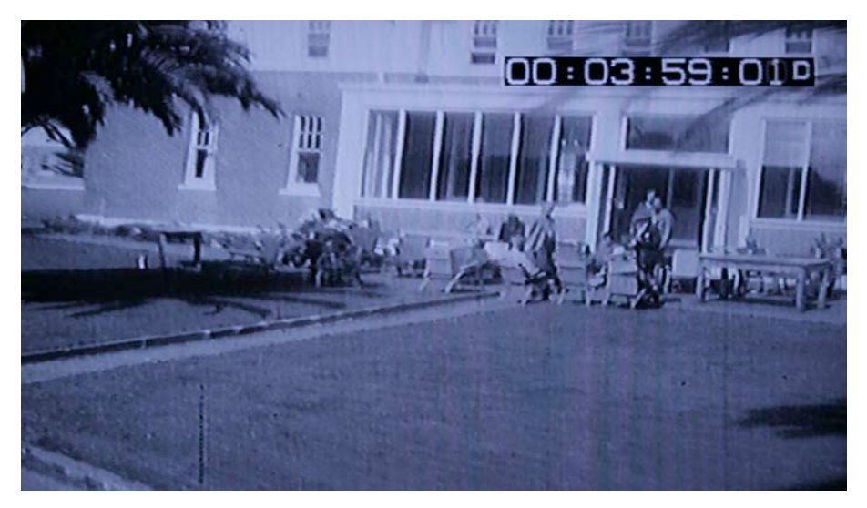
Figure 9: Still from Compass: Mental Health. New Zealand Broadcasting Commission, 1967. TVNZ Archive.

as Goffman and Frame, nor could they influence the NZBC in their line of critical questioning. They could, however, influence the footage that was shot within the grounds of their own hospitals.