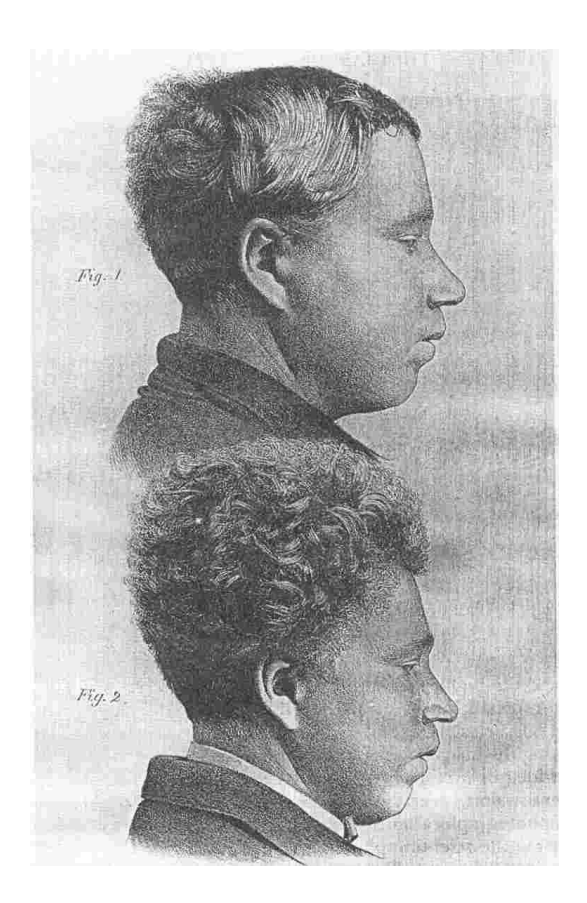
Figure 7: From Dr Räuber, "Ein Fall von periodisch wiederkehrender Haarveränderung bei einem Epileptiker," [Virchows] Archiv für pathologische Anatomie und Physiologie 97 (1884): 50-83, plate no. 2. (Bethesda, Md.: National Library of Medicine

An article in Der Spiegel uses a similar visual language with regard to Ensslin in order to hystericize her. It includes three images of Ensslin arranged in a vertical line, similar to figure 7. The first photograph shows a young Ensslin with a short, straight sensible haircut; the obedient German daughter par excellence. The second image shows Ensslin with long slightly straggly blond hair, connoting slightly subversive ideas of sexuality and vitality. In the final image, Ensslin has much darker short curly out-of-control hair which signifies a sort of hysterical madness (the German phrase "Krauses Haar, krauser Sinn" (literally "frizzy hair, frizzy mind.") springs to mind).