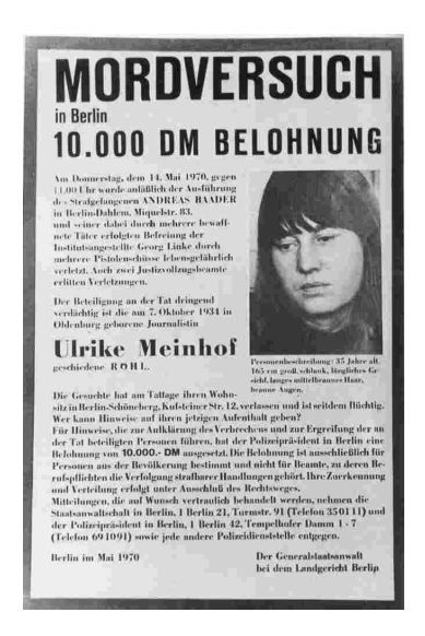
Figure 4: The famous "wanted" poster, printed in countless newspapers.