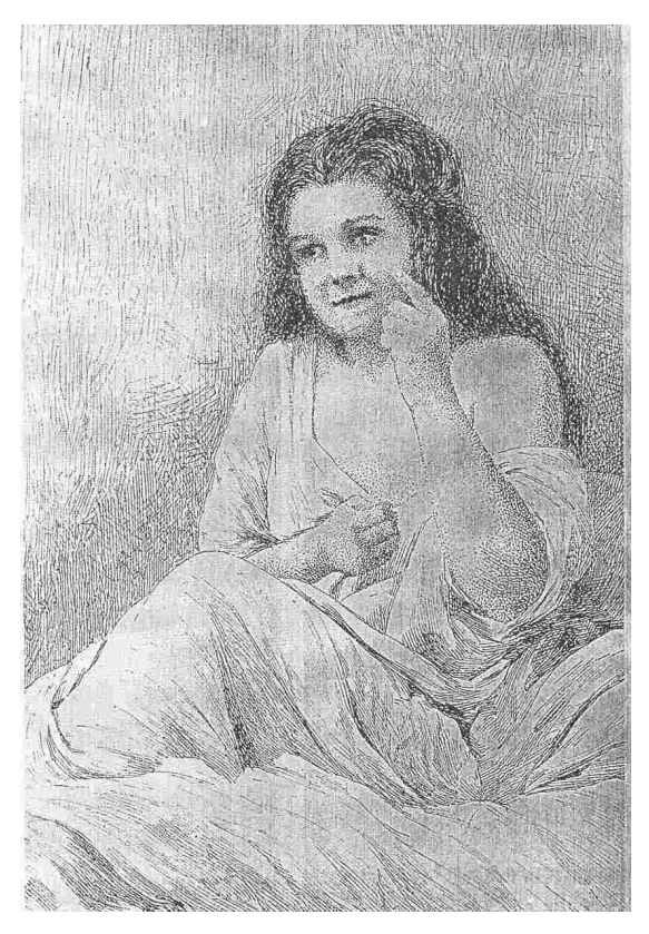
Figure 3: Paul Regnard, Les maladies épidémiques de l'esprit: sorcellerie magnétisme, morphisme, délire des grandeurs. (Paris: E. Plon, Nourrit et Cie, 1887), p. 87. (Bethesda, Md.: National Library of Medicine).

The most striking feature of this image is Ensslin's eyes which look to the side with a curious expression. As figures 3 demonstrates, the eyes are a central signifier – "the real clue" (Gilman 384) - of hysteria and visual hallucinations in the visual iconography of hysteria: