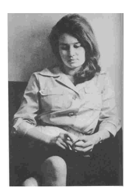
Figure 5: Meinhof the journalist (Prinz).

Meinhof's eyes and pose, more generally, echo an image from the iconography of the hysterical melancholic: