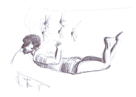
Figure 1: a hysterical pose