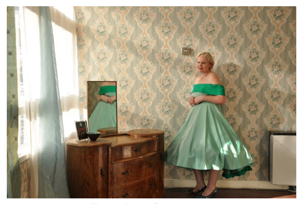
Figure 7: Frock, photograph of filmed performance / installation, Shelmerdine Close, East London, UK

universal but affected by the language we speak, our culture, environmental factors and our gender. Colour perception is also affected by sound as well as other colours and therefore audience durational perception of time can be influenced to slow or increase films tempo. The symbolism of colour in films can mean many seemingly contradictory concepts even within the same film, demonstrating the major contextual roles in its meaning.