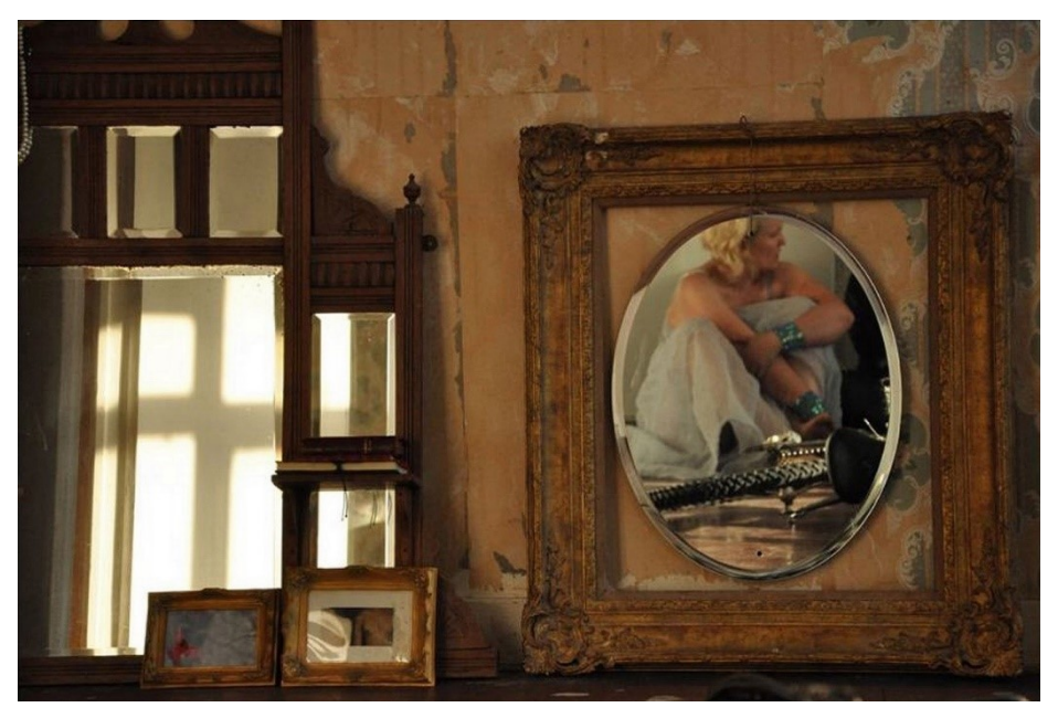
Figure 3: Cycle , photograph of performance, Shelmerdine Close, East London, UK

The two selected camera viewpoints (one situated on the dressing table and the other facing the window) as presented in the film Cycle eventually became intertwined in the editing process<sup>7</sup>. For an instant I appeared to transcend and then multiply, becoming one with the maisonette's interior, exploring existence and objects through time and space. Francesca Woodman's photographic gelatin silver prints from the House series (1975-1976) influenced the aesthetics of my project, for example through the layering of a female body, blurred by movement and long exposure (Lomas 2009). Although in Cycle the film's varying viewpoints are in colour and record the sequence of movements. On the relationship of the viewer with the actor or action in conventional film, Gravity 7 notes "the signifying production of moving image and sound would have to peel off the printed page to unravel on the cutting room floor, awaiting new modes of reconstruction and assemblage" (Chan 2007).