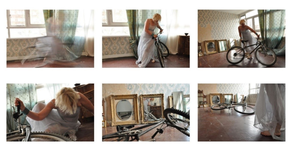
Figure 4: Cycle, photographs of performance (author), Shelmerdine Close, London, UK

The two selected camera viewpoints (one situated on the dressing table and the other facing the window) as presented in the film Cycle eventually became intertwined in the editing process<sup>7</sup>. For an instant I appeared to transcend and then multiply, becoming one with the maisonette's interior, exploring existence and objects through time and space. Francesca Woodman's photographic gelatin silver prints from the House series (1975-1976) influenced the aesthetics of my project, for example through the layering of a female body, blurred by movement and long exposure (Lomas 2009). Although in Cycle the film's varying viewpoints are in colour and record the sequence of movements. On the relationship of the viewer with the actor or action in conventional film, Gravity 7 notes "the signifying production of moving image and sound would have to peel off the printed page to unravel on the cutting room floor, awaiting new modes of reconstruction and assemblage" (Chan 2007).