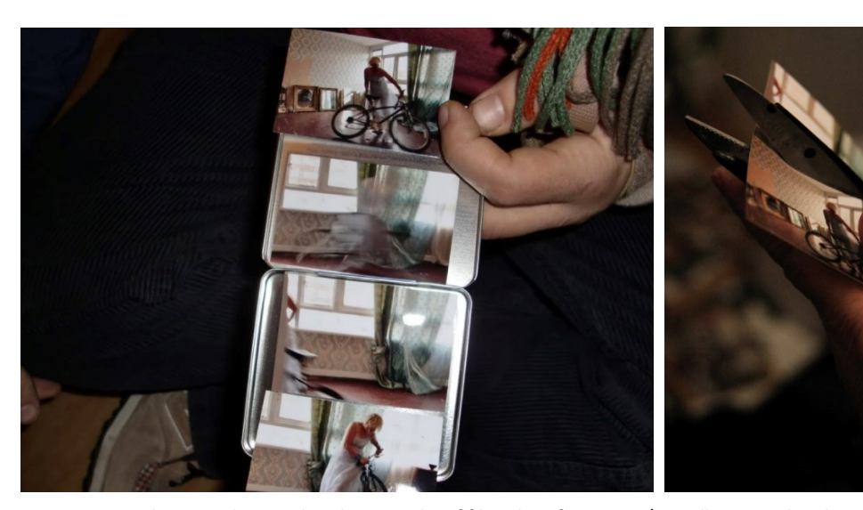
Figures 8 and 9: Boxed artworks, photographs of filmed performance / installation and audience member cutting up photographs. Shelmerdine Close, East London, UK.

Most people were delighted to find something other than just an artist's home studio and [to] take part in an artwork that was about them as much as the pieces in the space. There was a sense of people feeling that they were part of something special, of achievement for being brave enough or even smart enough to take up the invitation from Freecycle, some were so excited that they had come to one of the 'mysterious art happenings' that they had heard of but never been to as they were not 'in the art world' (Heald 2014, 118–119).