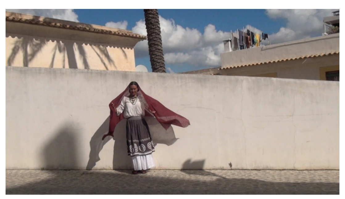
Figure 1: FRIDA Travels to Ibiza, film still of performance, Old Town, Ibiza, Spain

My practice synthesises the relationship between travel, art history, film and painting. This is especially significant in the FRIDAm Series (2017), an ongoing collaborative project with artist Sally Turner researching the life of Mexican artist Frida Kahlo. Turner and I first began collaborating in 2003; Turner working as a performance artist and myself as a fine art filmmaker. The title of FRIDAm was chosen as a play on the words 'freedom' and 'Frida', Kahlo's first name. The focus was on Kahlo's legacy, her approach to politics, women's equality, overcoming disability and establishing herself as a painter. Exploring the concept of how Kahlo might react and respond to an evolving art scene, FRIDAm attempts to capture the essence of Kahlo's spirit in a contemporary world. Working closely with Turner, who has a striking resemblance to Frida, has enabled a relationship to unfold, a rapport to evolve that transcribes through the films.