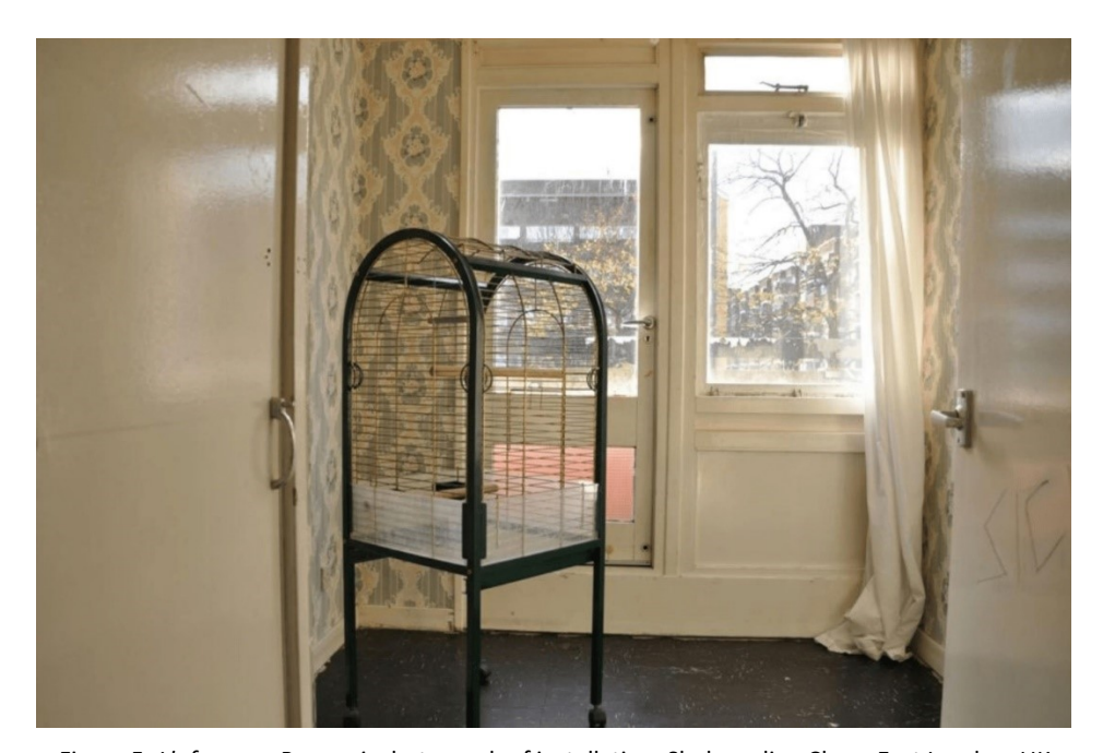
Figure 5: Llafarganu Papagei , photograph of installation, Shelmerdine Close, East London, UK

The twenty-minute looped audio commenced with a quiet two-minute solo recital. This monologue was repeated until midway through a second voice melded with the first. As the piece progressed, the two additional female voices joined the collective, all with different regional accents, which depicted the diversity of the local population. As the voices increased, they clamoured for attention until reaching a crescendo and then, slowly finding their own rhythm, they reduced to a single monologue once again. The sound seeped through small speakers situated around the perimeters of the room. Within this audio installation, just as in my 'dream films', the piece was as much about sounds, textures, colours and compositions as about social commitments.