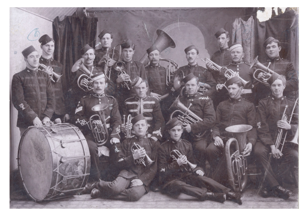
Fig. 5: Thurso Town Band c.1900

With the demise of Thurso's Volunteer 'Town' band in 1907, the rise of the Salvation Army temperance movement, which welcomed women as well as men to their bands, provided an alternative outlet for morally improving musical activity (Fig. 6).