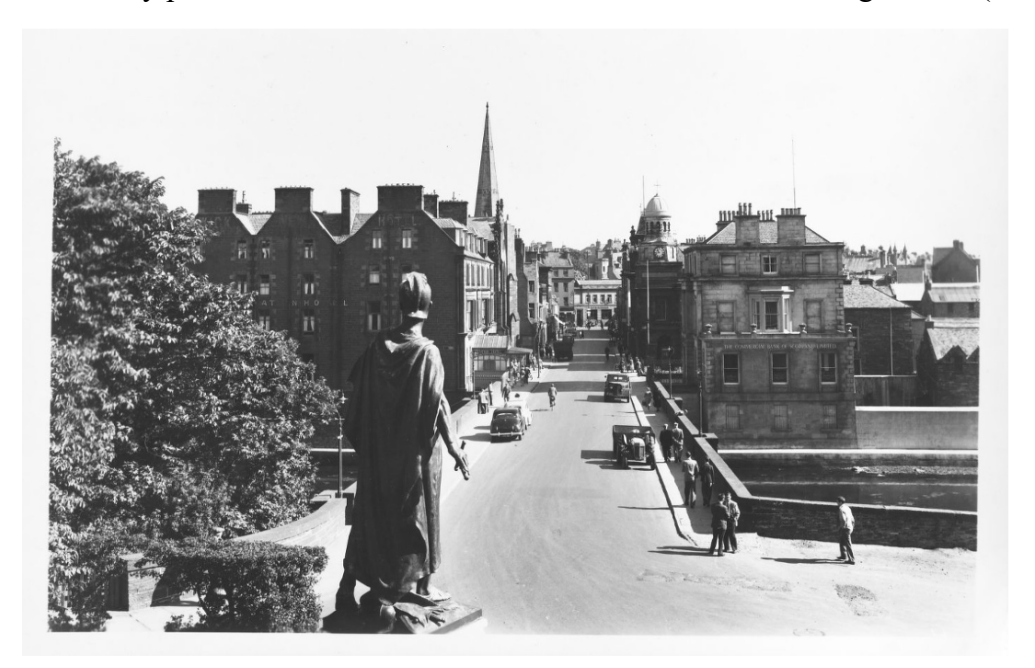
Fig. 7: Wick War Memorial, 1955. James Valentine Photographic Collection, item ref. JV-D-956. Courtesy of University of St Andrews Library.

Looking at the young men pictured in Figure 5, it is hard not to be moved by the thought that they, their peers, and in some cases their sons would go on to fight and possibly lose their lives in the Great War, in many ways the culmination of the militarised civic culture of the nineteenth century. The death toll of army personnel involved in that conflict in Caithness was significant ( Table 2 ). 94