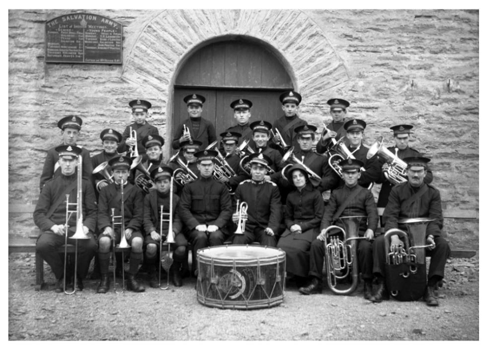
Fig. 6: Thurso Salvation Army Band c.1920–29.

With the demise of Thurso's Volunteer 'Town' band in 1907, the rise of the Salvation Army temperance movement, which welcomed women as well as men to their bands, provided an alternative outlet for morally improving musical activity (Fig. 6).